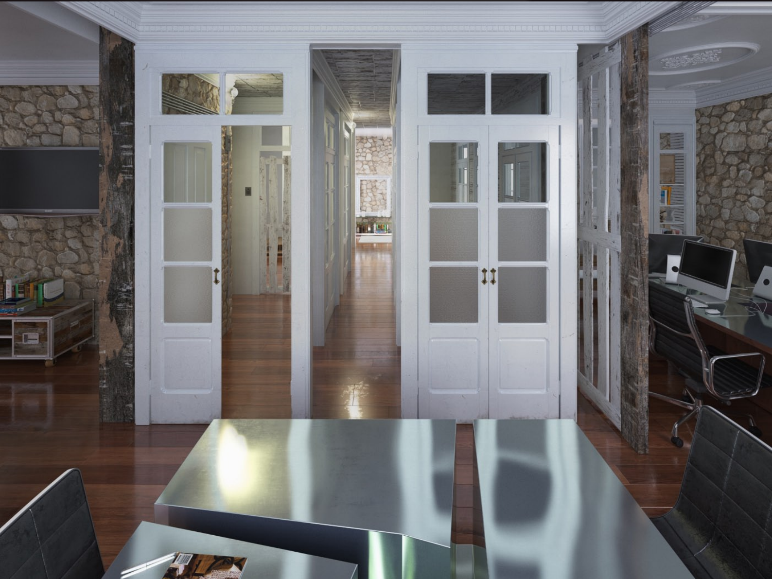
scene 01 cam 02 post production

Have you ever wanted to make professional interior renderings? Do you know how to use V-RaySun, V-RaySky and V-RayPhysicalCamera? Have you ever had problems with composition? Archinteriors will end all your problems. Take a look at this 10 fully textured scenes with professional shaders and lighting ready to render. Get your own portfolio and join cg market.