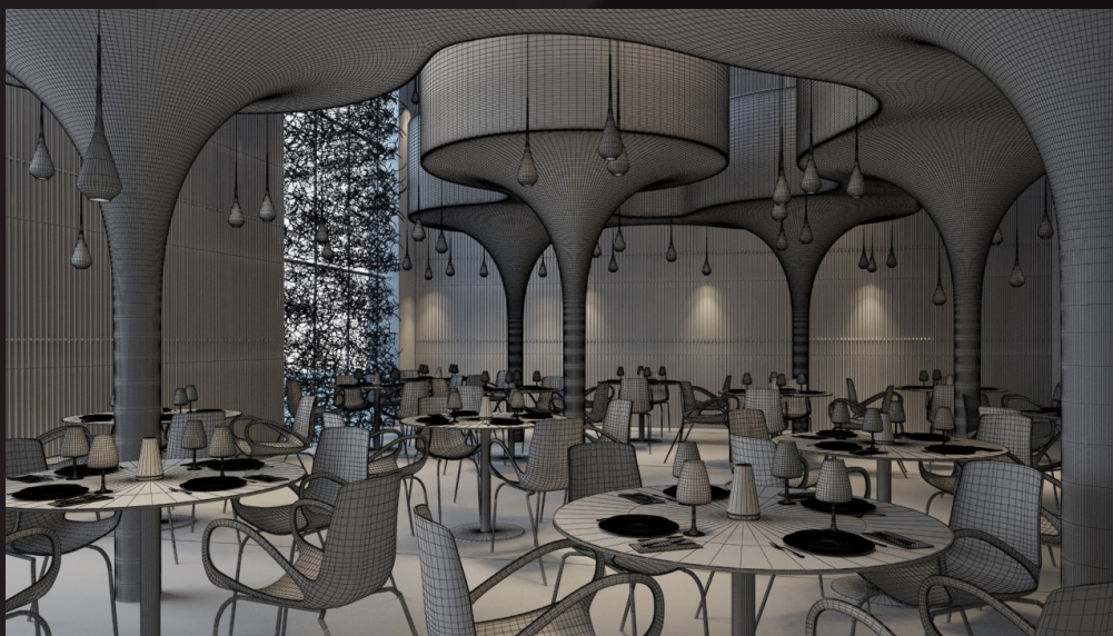
scene 03 cam 01 wire

Software and models © 2014 EVERMOTION. EVERMOTION logo is trademark or registered trademark of Evermotion Inc. in the U.S. and/or other countries. All rights reserved. All *.max and bitmaps models included on this collection with data are an integral part of „archinteriors vol.34” and the resale of this data is strictly prohibited. All models can be used for commercial purposes only by owners who bought this collection. The sharing of collection is strictly prohibited unless that user has written authorization from EVERMOTION.