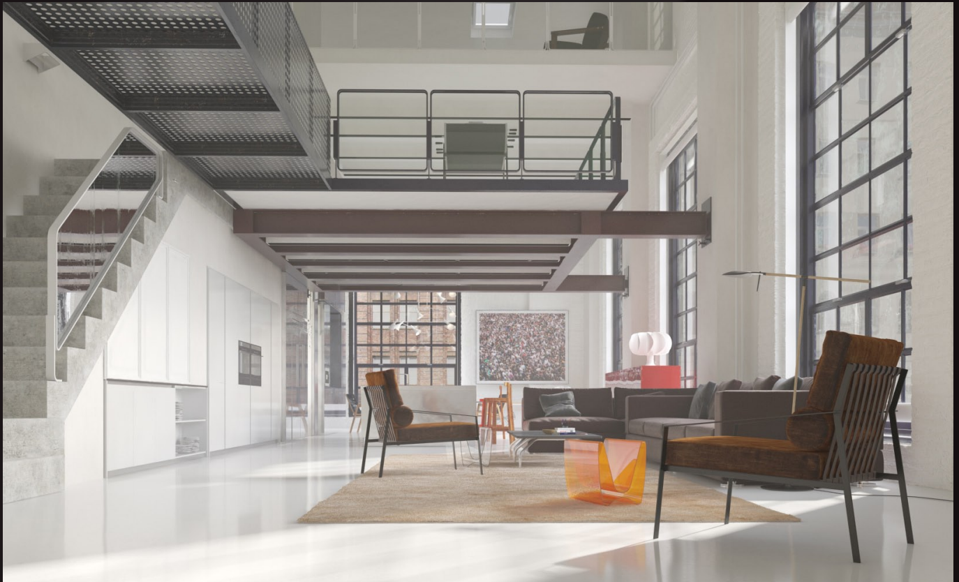
scene 04 cam 02 raw

Have you ever wanted to make professional interior renderings? Do you know how to use V-RaySun, V-RaySky and V-RayPhysicalCamera? Have you ever had problems with composition? Archexteriors will end all your problems. Take a look at this 10 fully textured scenes with professional shaders and lighting ready to render. Get your own portfolio and join cg market.