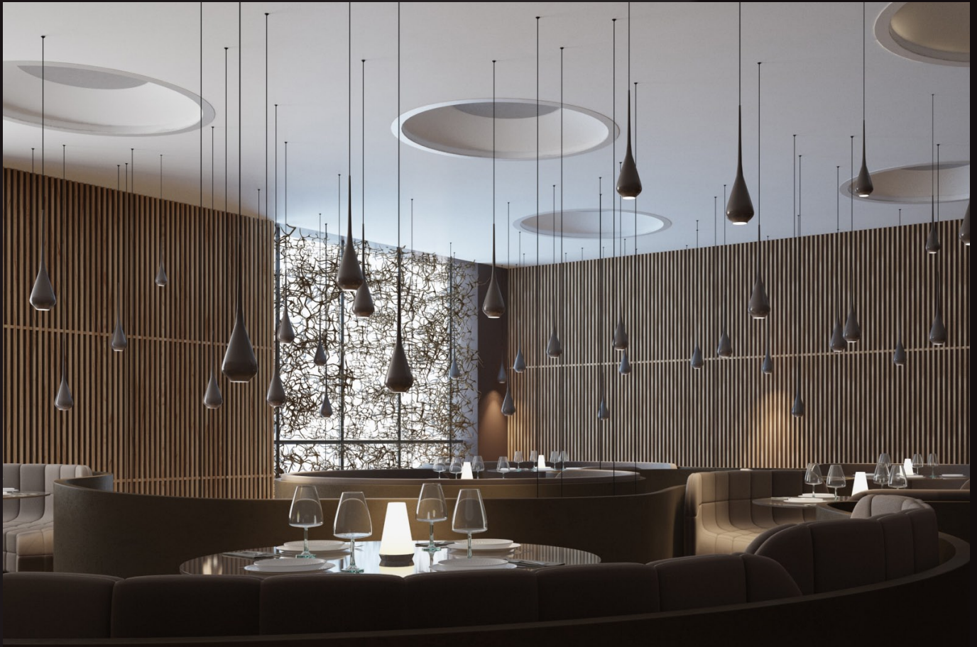
scene 03 cam 02 raw

Have you ever wanted to make professional interior renderings? Do you know how to use V-RaySun, V-RaySky and V-RayPhysicalCamera? Have you ever had problems with composition? Archexteriors will end all your problems. Take a look at this 10 fully textured scenes with professional shaders and lighting ready to render. Get your own portfolio and join cg market.