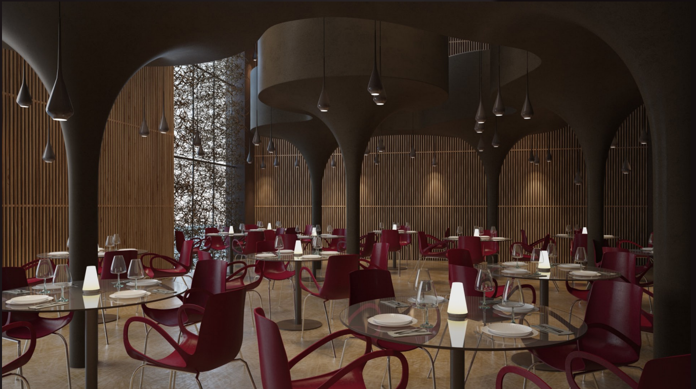
scene 03 cam 01 raw

Have you ever wanted to make professional interior renderings? Do you know how to use V-RaySun, V-RaySky and V-RayPhysicalCamera? Have you ever had problems with composition? Archexteriors will end all your problems. Take a look at this 10 fully textured scenes with professional shaders and lighting ready to render. Get your own portfolio and join cg market.