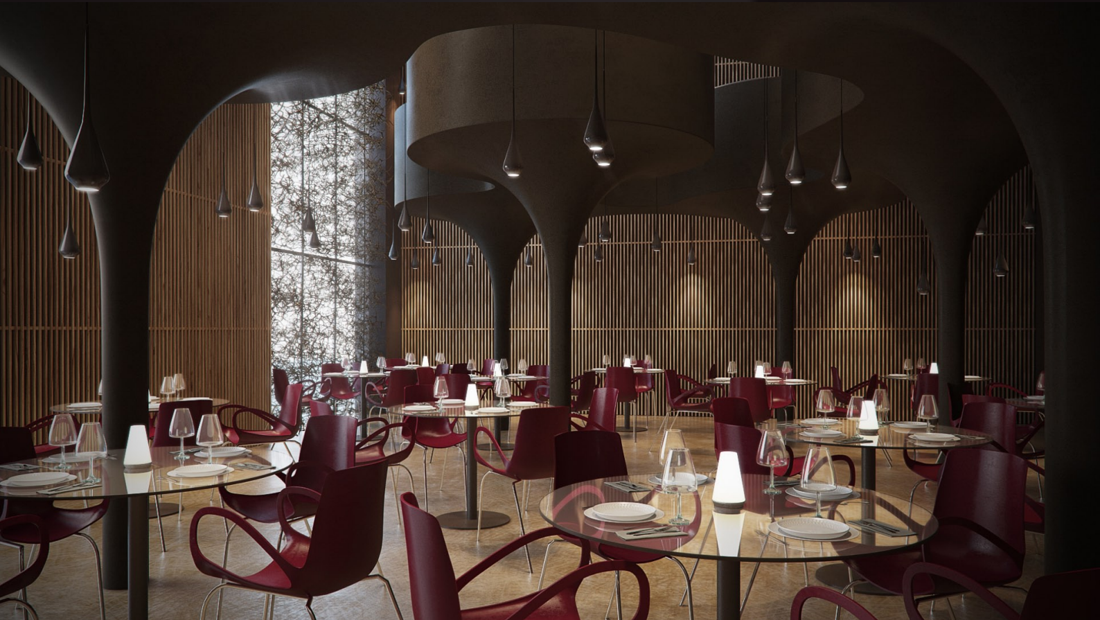
scene 03 cam 01 post production

Have you ever wanted to make professional interior renderings? Do you know how to use V-RaySun, V-RaySky and V-RayPhysicalCamera? Have you ever had problems with composition? Archinteriors will end all your problems. Take a look at this 10 fully textured scenes with professional shaders and lighting ready to render. Get your own portfolio and join cg market.