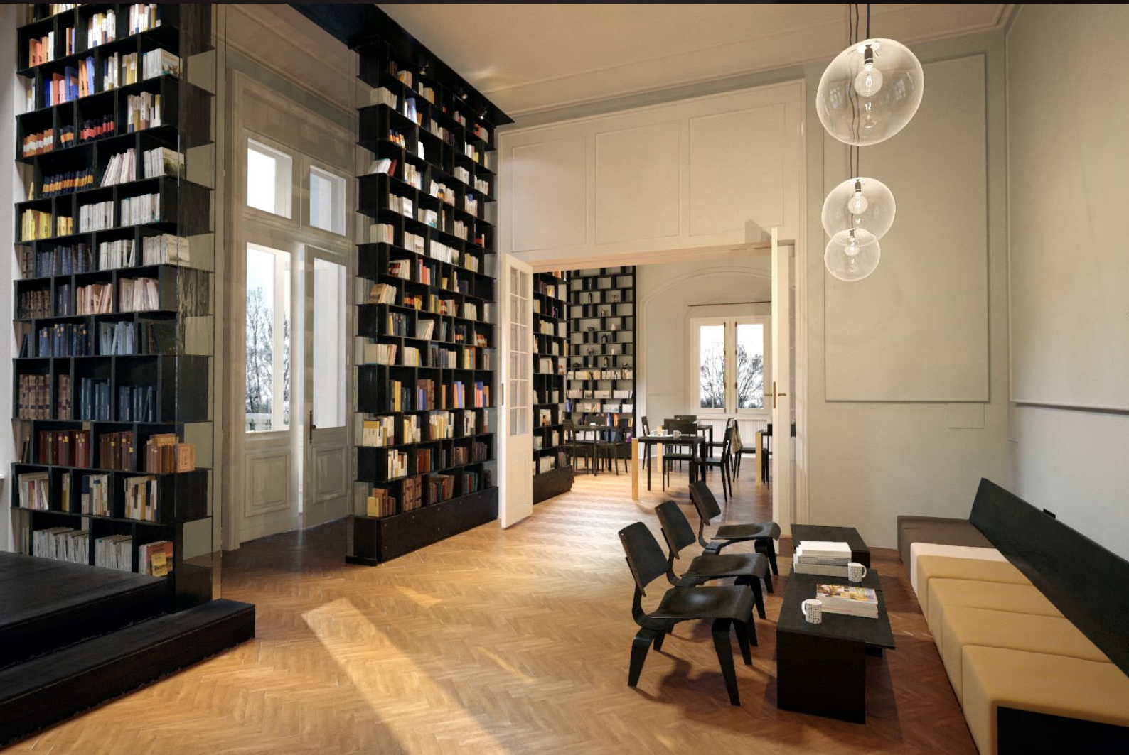
scene 02 cam 02 post production

Have you ever wanted to make professional interior renderings? Do you know how to use V-RaySun, V-RaySky and V-RayPhysicalCamera? Have you ever had problems with composition? Archinteriors will end all your problems. Take a look at this 10 fully textured scenes with professional shaders and lighting ready to render. Get your own portfolio and join cg market.