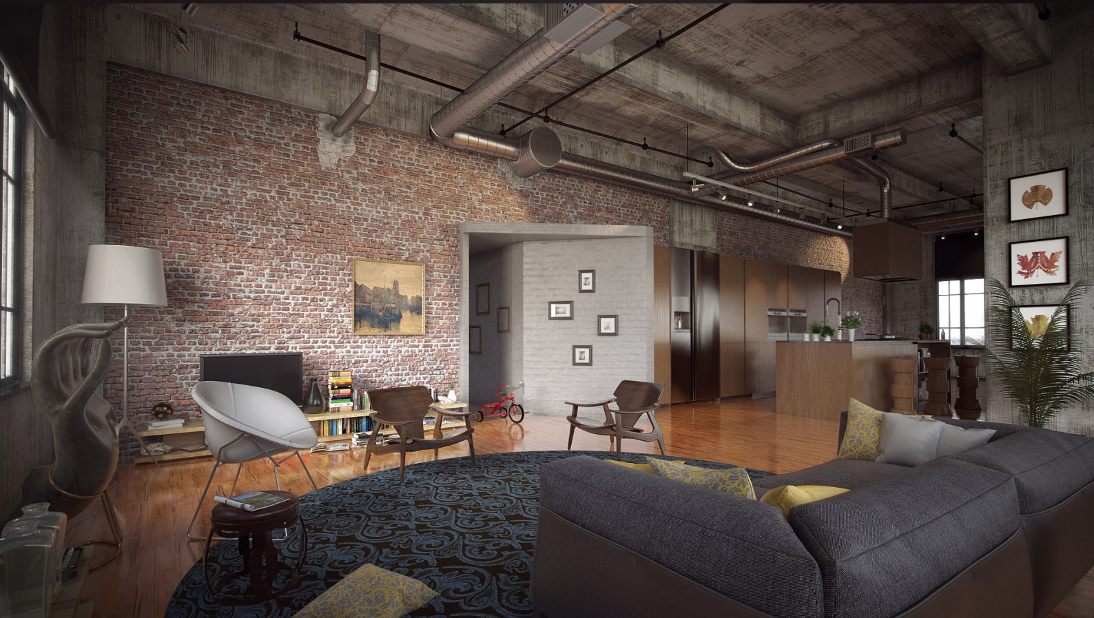
scene 05 cam 01 post production

Have you ever wanted to make professional interior renderings? Do you know how to use V-RaySun, V-RaySky and V-RayPhysicalCamera? Have you ever had problems with composition? Archinteriors will end all your problems. Take a look at this 10 fully textured scenes with professional shaders and lighting ready to render. Get your own portfolio and join cg market.