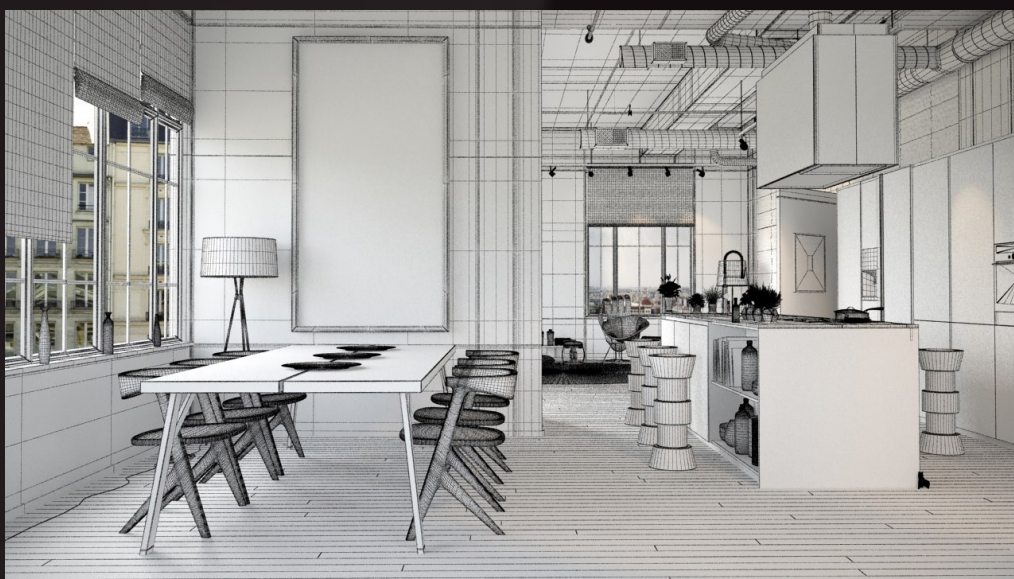
scene 05 cam 02 wire

Software and models © 2014 EVERMOTION. EVERMOTION logo is trademark or registered trademark of Evermotion Inc. in the U.S. and/or other countries. All rights reserved. All *.max and bitmaps models included on this collection with data are an integral part of „archinteriors vol.34” and the resale of this data is strictly prohibited. All models can be used for commercial purposes only by owners who bought this collection. The sharing of collection is strictly prohibited unless that user has written authorizati on from EVERMOTION.