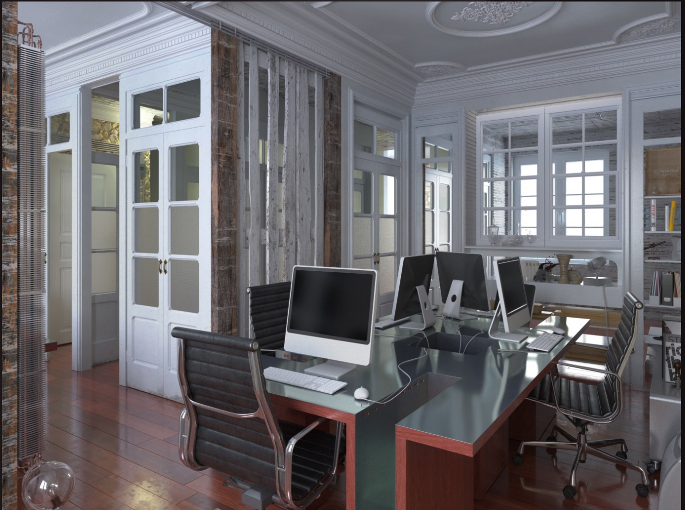
scene 01 cam 01 raw

Have you ever wanted to make professional interior renderings? Do you know how to use V-RaySun, V-RaySky and V-RayPhysicalCamera? Have you ever had problems with composition? Archexteriors will end all your problems. Take a look at this 10 fully textured scenes with professional shaders and lighting ready to render. Get your own portfolio and join cg market.