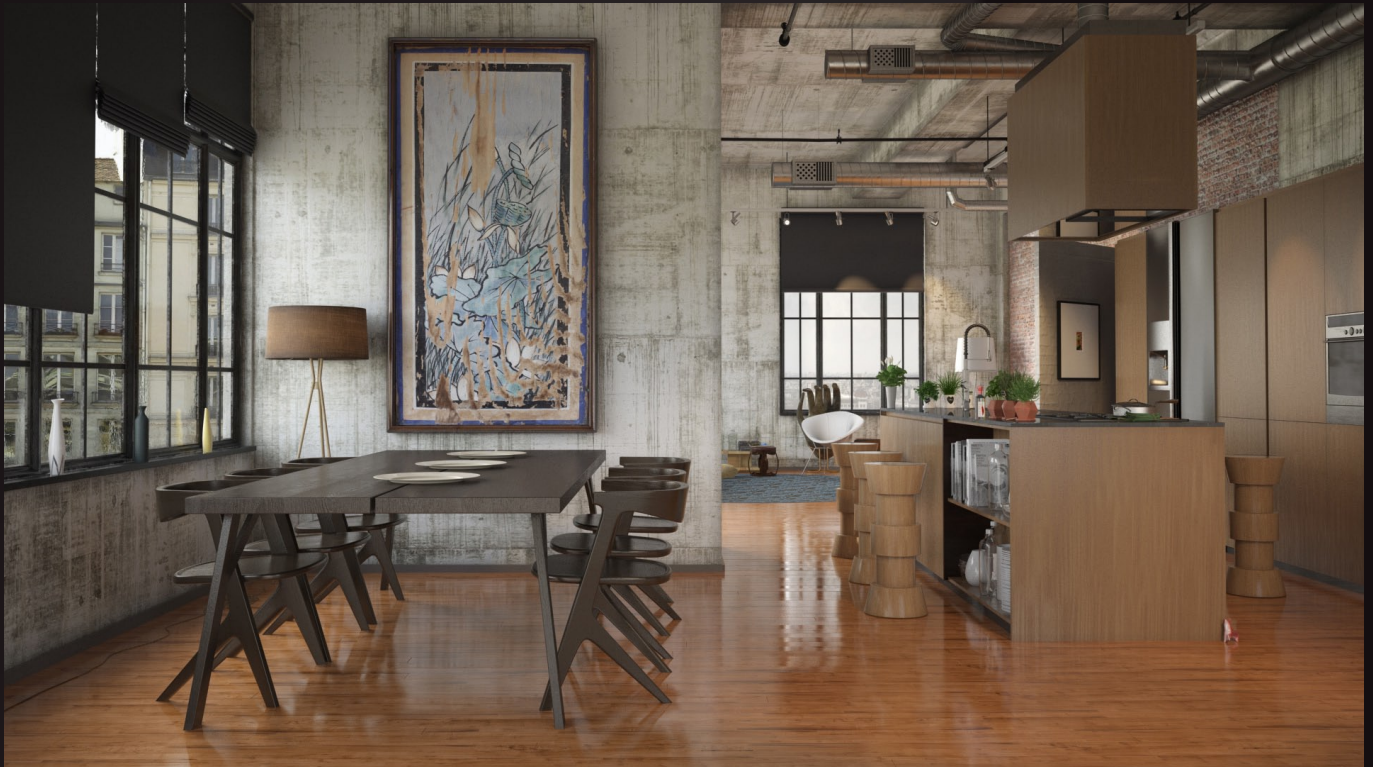
scene 05 cam 02 raw

Have you ever wanted to make professional interior renderings? Do you know how to use V-RaySun, V-RaySky and V-RayPhysicalCamera? Have you ever had problems with composition? Archexteriors will end all your problems. Take a look at this 10 fully textured scenes with professional shaders and lighting ready to render. Get your own portfolio and join cg market.