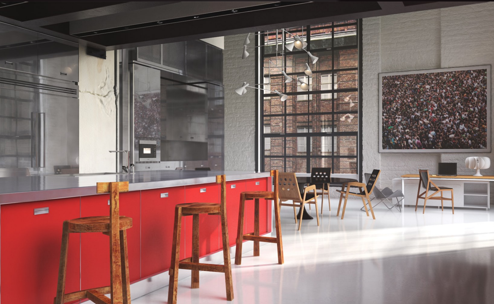
scene 04 cam 01 post production

Have you ever wanted to make professional interior renderings? Do you know how to use V-RaySun, V-RaySky and V-RayPhysicalCamera? Have you ever had problems with composition? Archinteriors will end all your problems. Take a look at this 10 fully textured scenes with professional shaders and lighting ready to render. Get your own portfolio and join cg market.