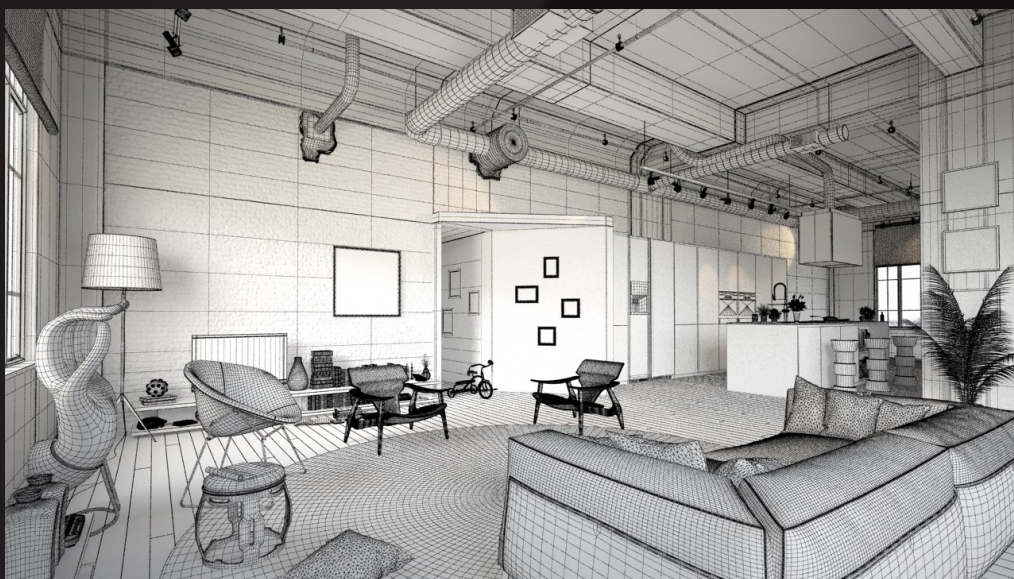
scene 05 cam 01 wire

Software and models © 2014 EVERMOTION. EVERMOTION logo is trademark or registered trademark of Evermotion Inc. in the U.S. and/or other countries. All rights reserved. All *.max and bitmaps models included on this collection with data are an integral part of „archinteriors vol.34” and the resale of this data is strictly prohibited. All models can be used for commercial purposes only by owners who bought this collection. The sharing of collection is strictly prohibited unless that user has written authorizati on from EVERMOTION.