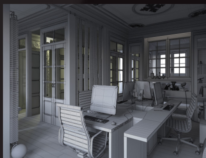
scene 01 wire

Software and models © 2014 EVERMOTION. EVERMOTION logo is trademark or registered trademark of Evermotion Inc. in the U.S. and/or other countries. All rights reserved. All *.max and bitmaps models included on this collection with data are an integral part of „archinteriors vol.34” and the resale of this data is strictly prohibited. All models can be used for commercial purposes only by owners who bought this collection. The sharing of collection is strictly prohibited unless that user has written authorization from EVERMOTION.