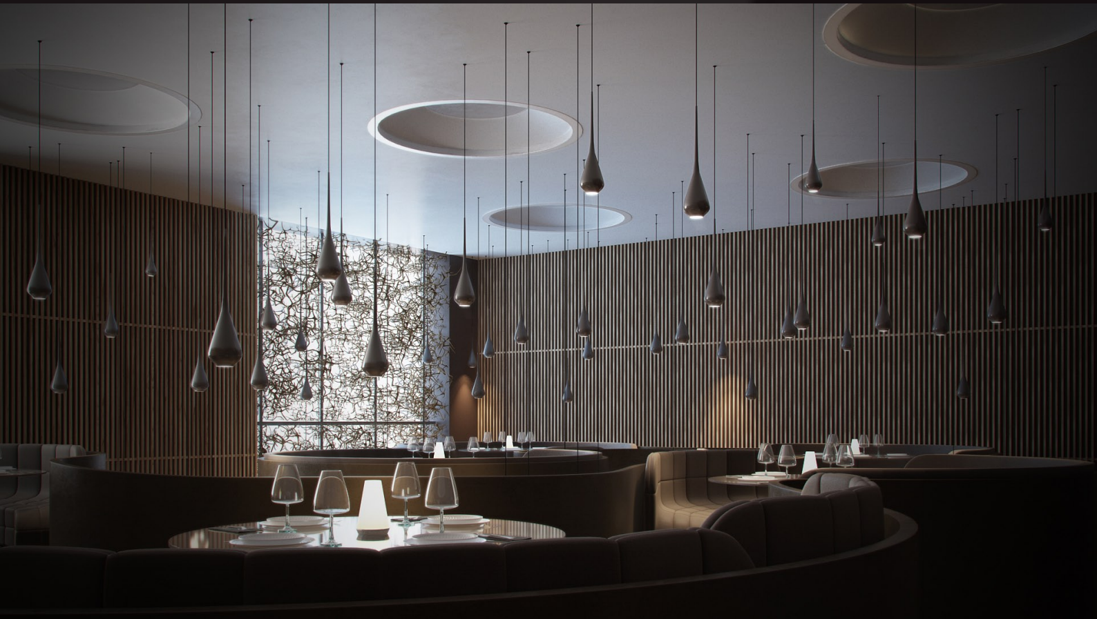
scene 03 cam 02 post production

Have you ever wanted to make professional interior renderings? Do you know how to use V-RaySun, V-RaySky and V-RayPhysicalCamera? Have you ever had problems with composition? Archinteriors will end all your problems. Take a look at this 10 fully textured scenes with professional shaders and lighting ready to render. Get your own portfolio and join cg market.