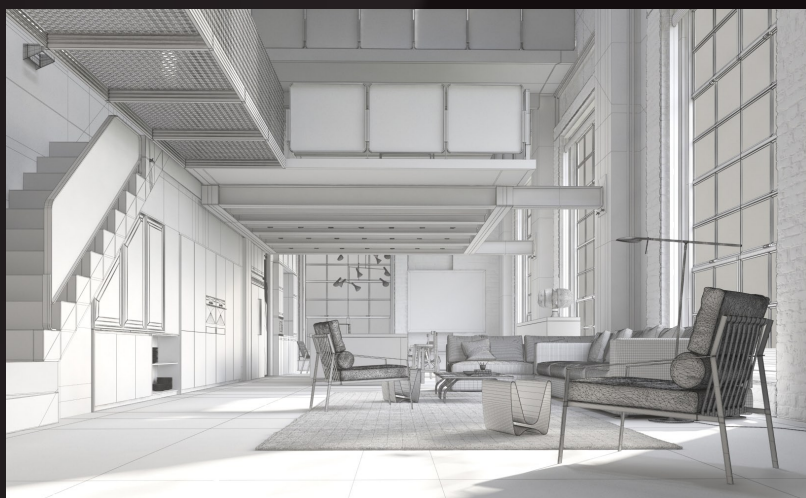
scene 04 cam 02 wire

Software and models © 2014 EVERMOTION. EVERMOTION logo is trademark or registered trademark of Evermotion Inc. in the U.S. and/or other countries. All rights reserved. All *.max and bitmaps models included on this collection with data are an integral part of „archinteriors vol.34” and the resale of this data is strictly prohibited. All models can be used for commercial purposes only by owners who bought this collection. The sharing of collection is strictly prohibited unless that user has written authorizati on from EVERMOTION.