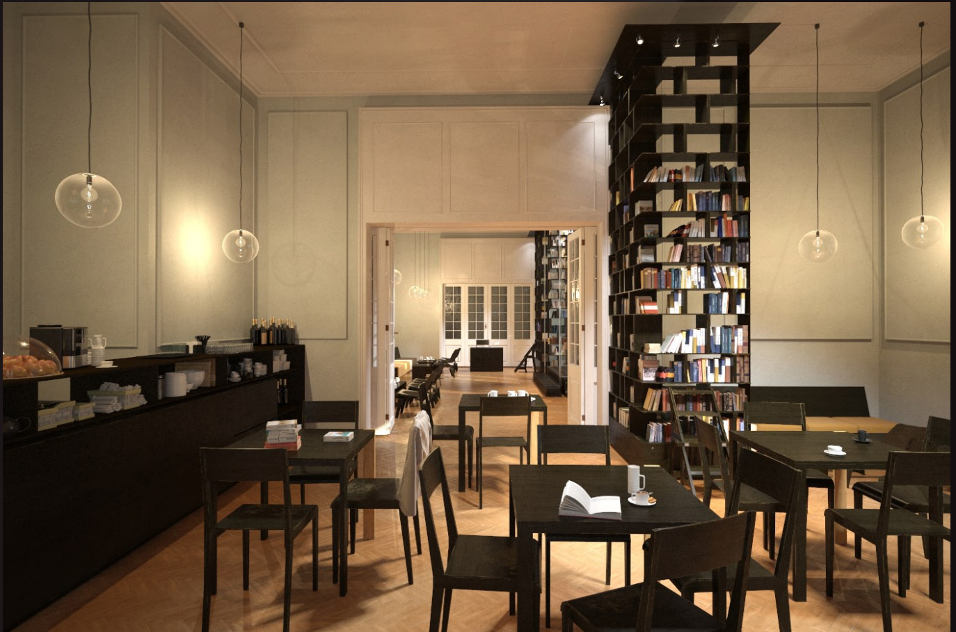
scene 02 cam 01 raw

Have you ever wanted to make professional interior renderings? Do you know how to use V-RaySun, V-RaySky and V-RayPhysicalCamera? Have you ever had problems with composition? Archexteriors will end all your problems. Take a look at this 10 fully textured scenes with professional shaders and lighting ready to render. Get your own portfolio and join cg market.