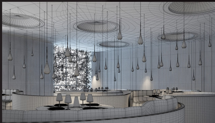
scene 03 cam 02 wire

Software and models © 2014 EVERMOTION. EVERMOTION logo is trademark or registered trademark of Evermotion Inc. in the U.S. and/or other countries. All rights reserved. All *.max and bitmaps models included on this collection with data are an integral part of „archinteriors vol.34” and the resale of this data is strictly prohibited. All models can be used for commercial purposes only by owners who bought this collection. The sharing of collection is strictly prohibited unless that user has written authorizati on from EVERMOTION.