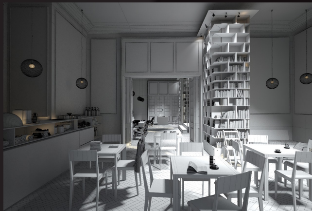
scene 02 cam 01 wire

Software and models © 2014 EVERMOTION. EVERMOTION logo is trademark or registered trademark of Evermotion Inc. in the U.S. and/or other countries. All rights reserved. All *.max and bitmaps models included on this collection with data are an integral part of „archinteriors vol.34” and the resale of this data is strictly prohibited. All models can be used for commercial purposes only by owners who bought this collection. The sharing of collection is strictly prohibited unless that user has written authorizati on from EVERMOTION.