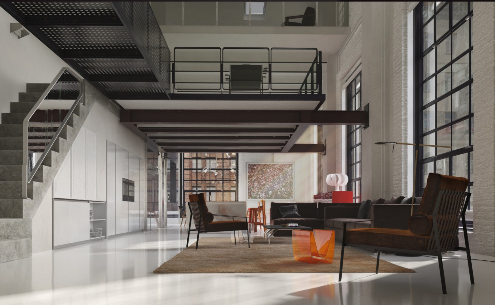
scene 04 cam 02 post production

Have you ever wanted to make professional interior renderings? Do you know how to use V-RaySun, V-RaySky and V-RayPhysicalCamera? Have you ever had problems with composition? Archinteriors will end all your problems. Take a look at this 10 fully textured scenes with professional shaders and lighting ready to render. Get your own portfolio and join cg market.