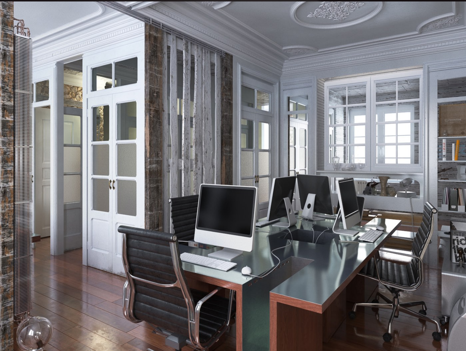
scene 01 cam 01 post production

Have you ever wanted to make professional interior renderings? Do you know how to use V-RaySun, V-RaySky and V-RayPhysicalCamera? Have you ever had problems with composition? Archinteriors will end all your problems. Take a look at this 10 fully textured scenes with professional shaders and lighting ready to render. Get your own portfolio and join cg market.