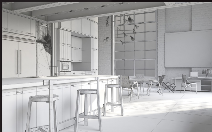
scene 04 cam 01 wire

Software and models © 2014 EVERMOTION. EVERMOTION logo is trademark or registered trademark of Evermotion Inc. in the U.S. and/or other countries. All rights reserved. All *.max and bitmaps models included on this collection with data are an integral part of „archinteriors vol.34” and the resale of this data is strictly prohibited. All models can be used for commercial purposes only by owners who bought this collection. The sharing of collection is strictly prohibited unless that user has written authorizati on from EVERMOTION.