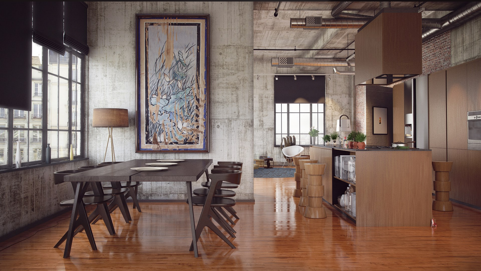
scene 05 cam 02 post production

Have you ever wanted to make professional interior renderings? Do you know how to use V-RaySun, V-RaySky and V-RayPhysicalCamera? Have you ever had problems with composition? Archinteriors will end all your problems. Take a look at this 10 fully textured scenes with professional shaders and lighting ready to render. Get your own portfolio and join cg market.