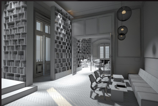
scene 02 cam 02 wire

Software and models © 2014 EVERMOTION. EVERMOTION logo is trademark or registered trademark of Evermotion Inc. in the U.S. and/or other countries. All rights reserved. All *.max and bitmaps models included on this collection with data are an integral part of „archinteriors vol.34” and the resale of this data is strictly prohibited. All models can be used for commercial purposes only by owners who bought this collection. The sharing of collection is strictly prohibited unless that user has written authorizati on from EVERMOTION.