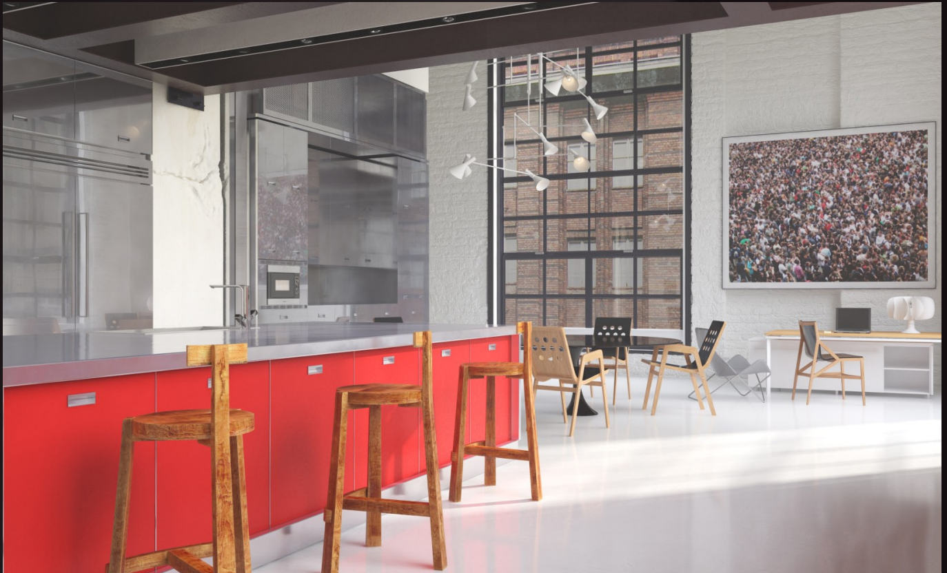
scene 04 cam 01 raw

Have you ever wanted to make professional interior renderings? Do you know how to use V-RaySun, V-RaySky and V-RayPhysicalCamera? Have you ever had problems with composition? Archexteriors will end all your problems. Take a look at this 10 fully textured scenes with professional shaders and lighting ready to render. Get your own portfolio and join cg market.