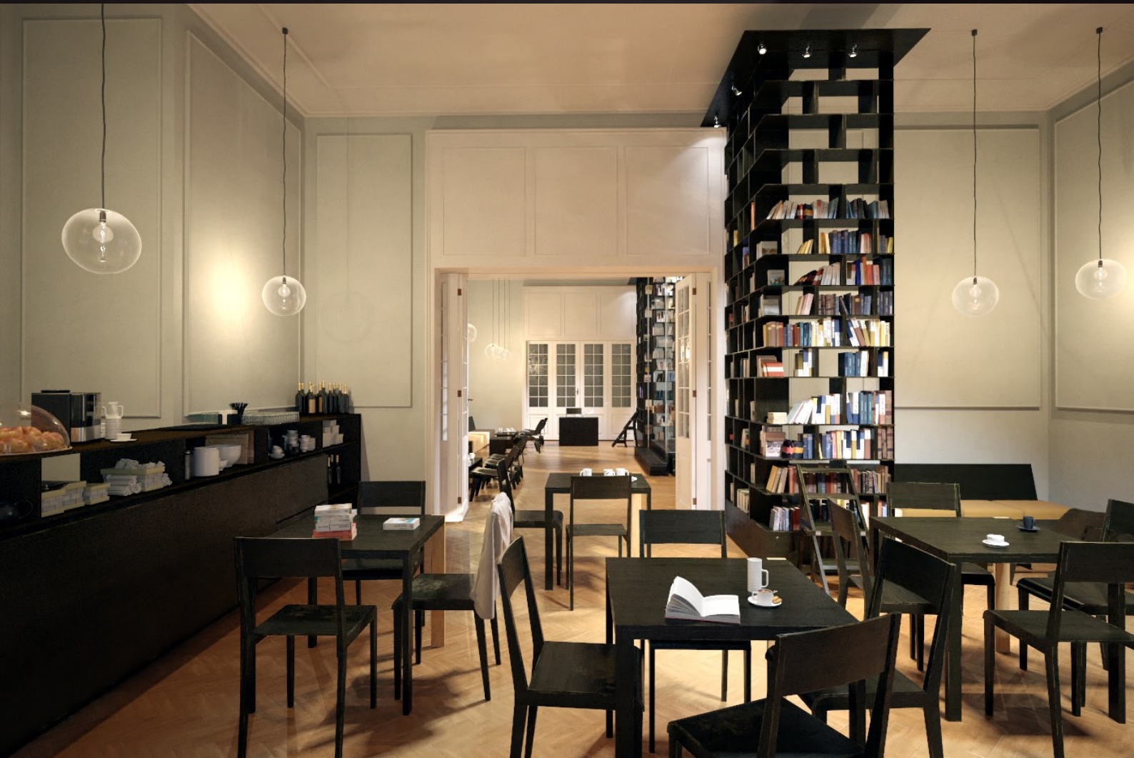
scene 02 cam 01 post production

Have you ever wanted to make professional interior renderings? Do you know how to use V-RaySun, V-RaySky and V-RayPhysicalCamera? Have you ever had problems with composition? Archinteriors will end all your problems. Take a look at this 10 fully textured scenes with professional shaders and lighting ready to render. Get your own portfolio and join cg market.