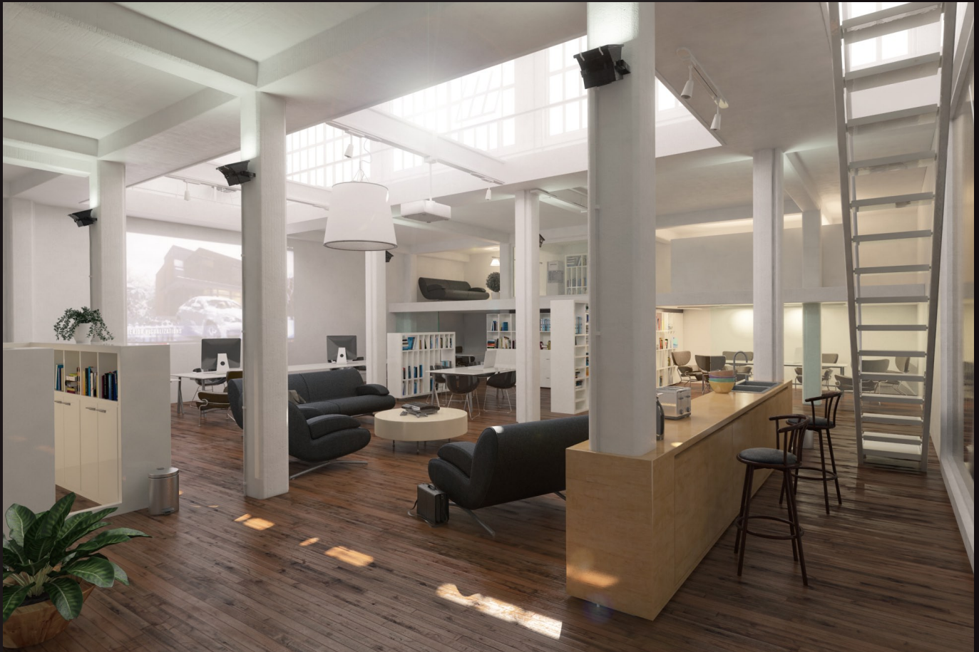
scene 09 post production

Have you ever wanted to make professional interior renderings? Do you know how to use V-RaySun, V-RaySky and V-RayPhysicalCamera? Have you ever had problems with composition? Archinteriors will end all your problems. Take a look at this 10 fully textured scenes with professional shaders and lighting ready to render. Get your own portfolio and join cg market.