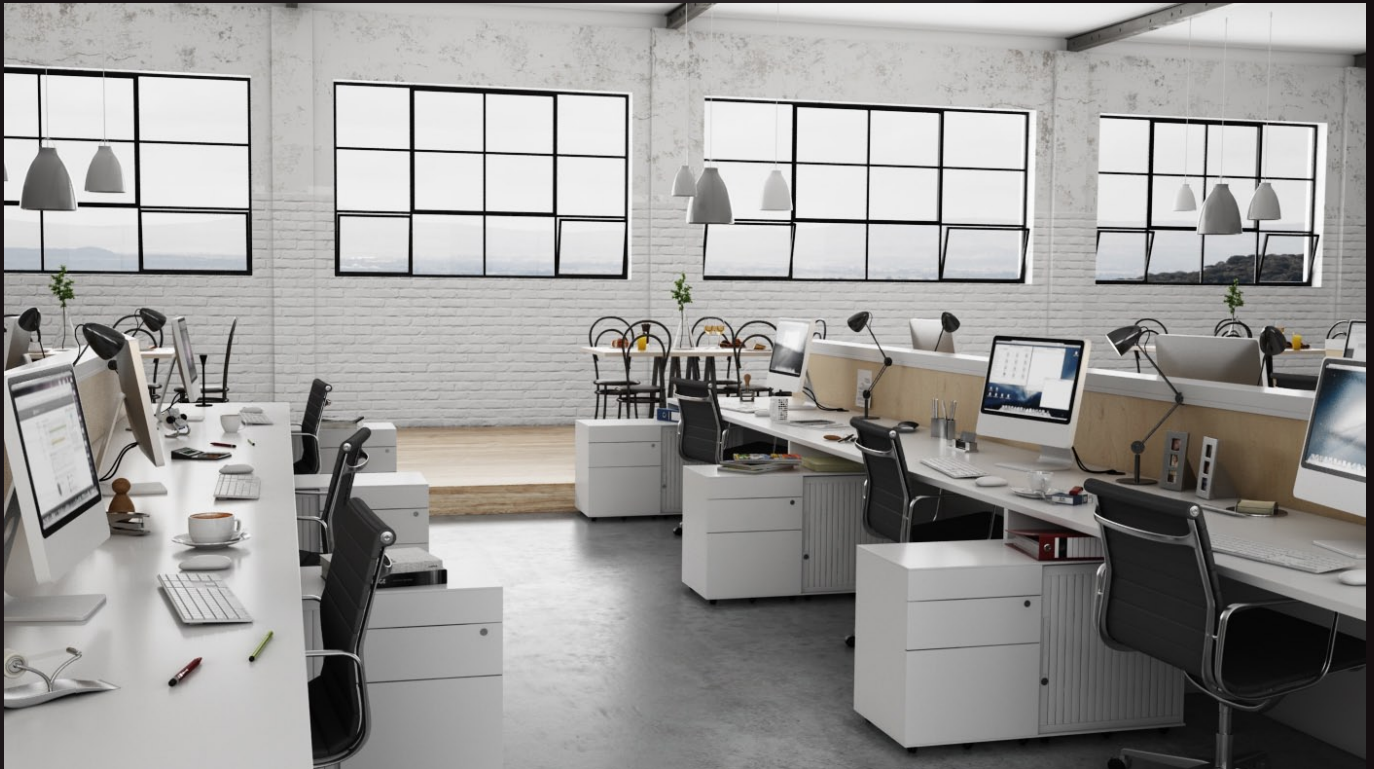
scene 02 raw

Have you ever wanted to make professional interior renderings? Do you know how to use V-RaySun, V-RaySky and V-RayPhysicalCamera? Have you ever had problems with composition? Archexteriors will end all your problems. Take a look at this 10 fully textured scenes with professional shaders and lighting ready to render. Get your own portfolio and join cg market.