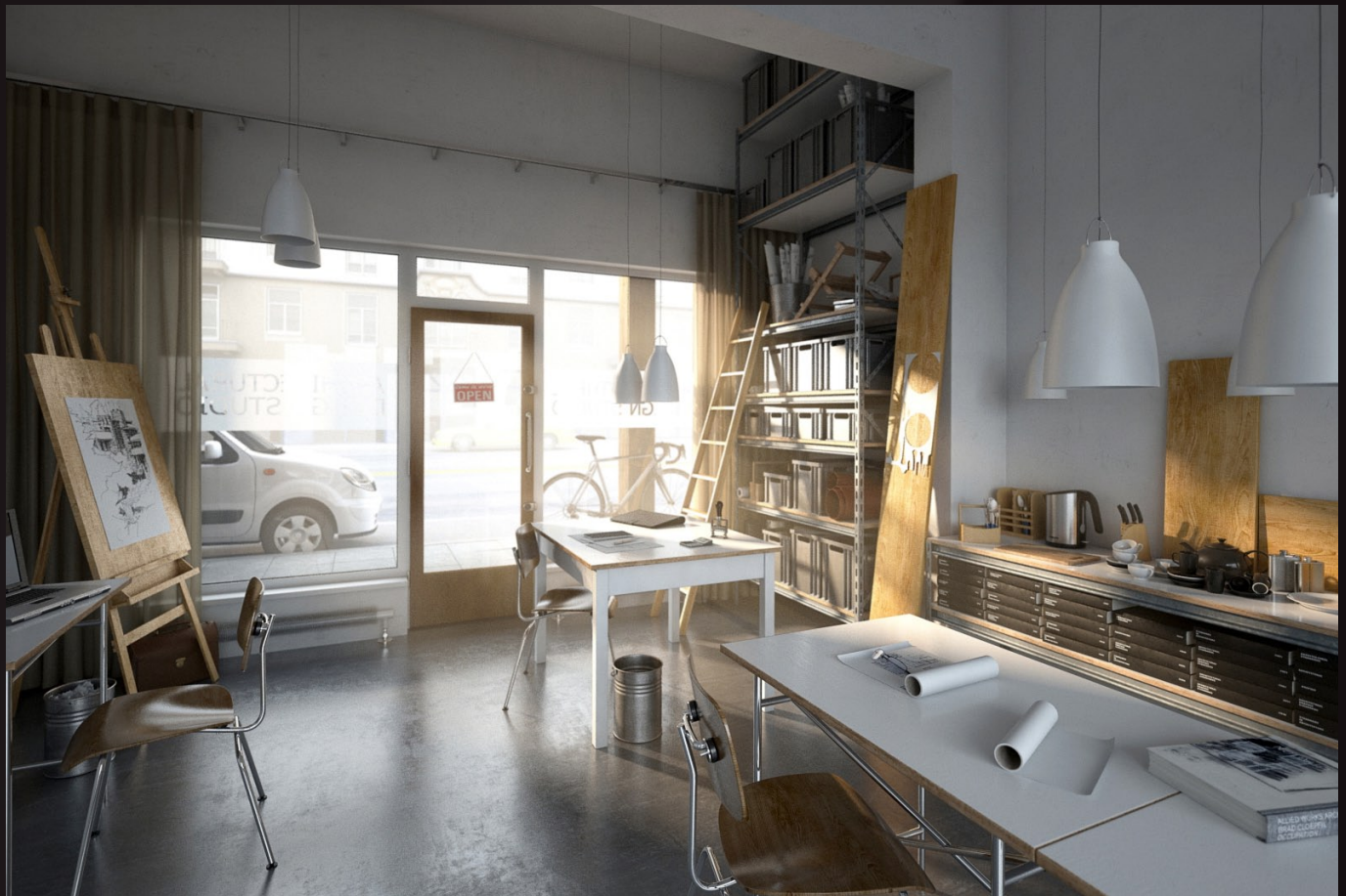
scene 06 post production

Have you ever wanted to make professional interior renderings? Do you know how to use V-RaySun, V-RaySky and V-RayPhysicalCamera? Have you ever had problems with composition? Archexteriors will end all your problems. Take a look at this 10 fully textured scenes with professional shaders and lighting ready to render. Get your own portfolio and join cg market.