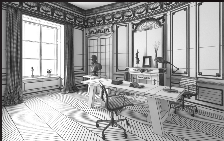
scene 04 wire

Software and models © 2014 EVERMOTION. EVERMOTION logo is trademark or registered trademark of Evermotion Inc. in the U.S. and/or other countries. All rights reserved. All *.max and bitmaps models included on this collection with data are an integral part of „archinteriors vol.32” and the resale of this data is strictly prohibited. All models can be used for commercial purposes only by owners who bought this collection. The sharing of collection is strictly prohibited unless that user has written authorization from EVERMOTION.