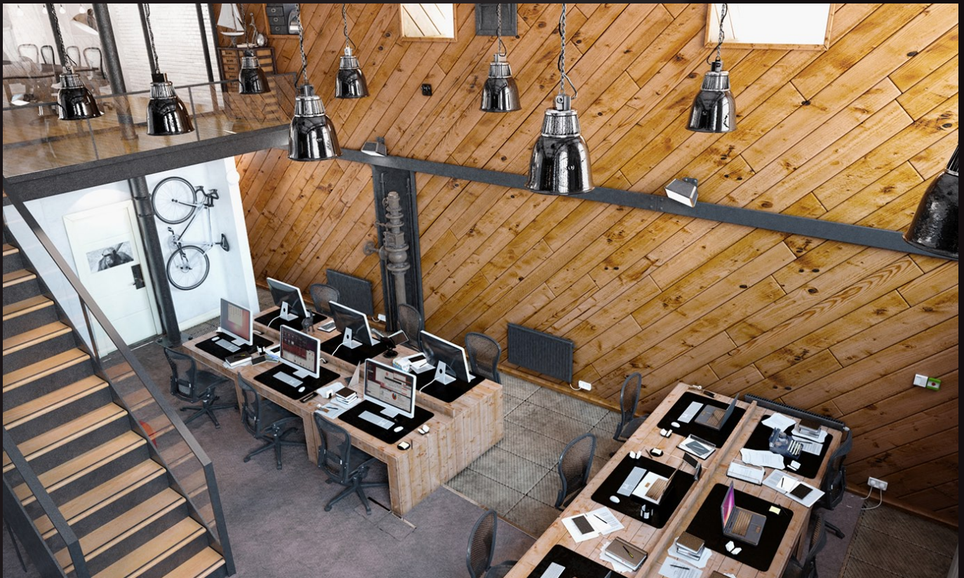
scene 01 raw

Have you ever wanted to make professional interior renderings? Do you know how to use V-RaySun, V-RaySky and V-RayPhysicalCamera? Have you ever had problems with composition? Archexteriors will end all your problems. Take a look at this 10 fully textured scenes with professional shaders and lighting ready to render. Get your own portfolio and join cg market.