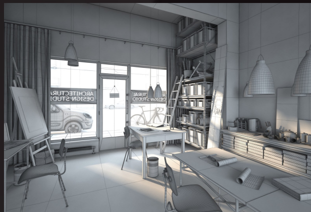
scene 06 wire

Software and models © 2014 EVERMOTION. EVERMOTION logo is trademark or registered trademark of Evermotion Inc. in the U.S. and/or other countries. All rights reserved. All *.max and bitmaps models included on this collection with data are an integral part of „archinteriors vol.32” and the resale of this data is strictly prohibited. All models can be used for commercial purposes only by owners who bought this collection. The sharing of collection is strictly prohibited unless that user has written authorizati on from EVERMOTION.