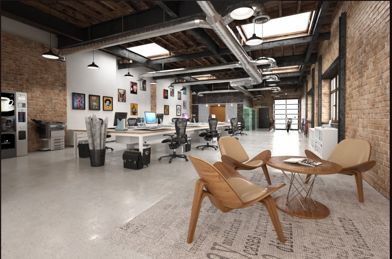
scene 08 raw

Have you ever wanted to make professional interior renderings? Do you know how to use V-RaySun, V-RaySky and V-RayPhysicalCamera? Have you ever had problems with composition? Archexteriors will end all your problems. Take a look at this 10 fully textured scenes with professional shaders and lighting ready to render. Get your own portfolio and join cg market.