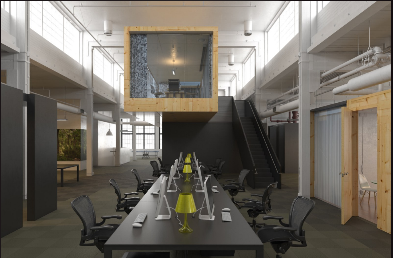
scene 07 raw

Have you ever wanted to make professional interior renderings? Do you know how to use V-RaySun, V-RaySky and V-RayPhysicalCamera? Have you ever had problems with composition? Archexteriors will end all your problems. Take a look at this 10 fully textured scenes with professional shaders and lighting ready to render. Get your own portfolio and join cg market.