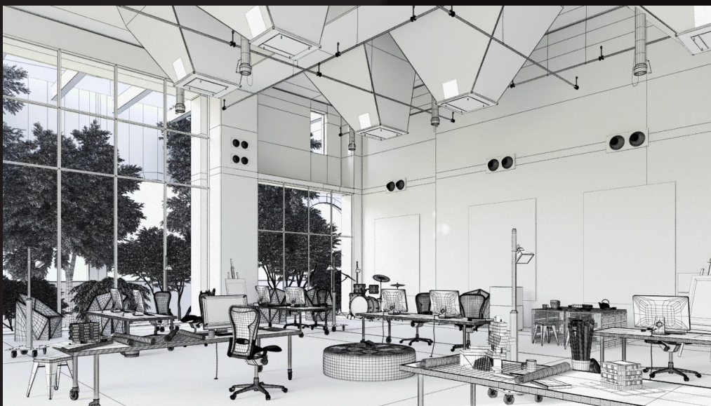
scene 10 wire

Software and models © 2014 EVERMOTION. EVERMOTION logo is trademark or registered trademark of Evermotion Inc. in the U.S. and/or other countries. All rights reserved. All *.max and bitmaps models included on this collection with data are an integral part of „archinteriors vol.32” and the resale of this data is strictly prohibited. All models can be used for commercial purposes only by owners who bought this collection. The sharing of collection is strictly prohibited unless that user has written authorization from EVERMOTION.