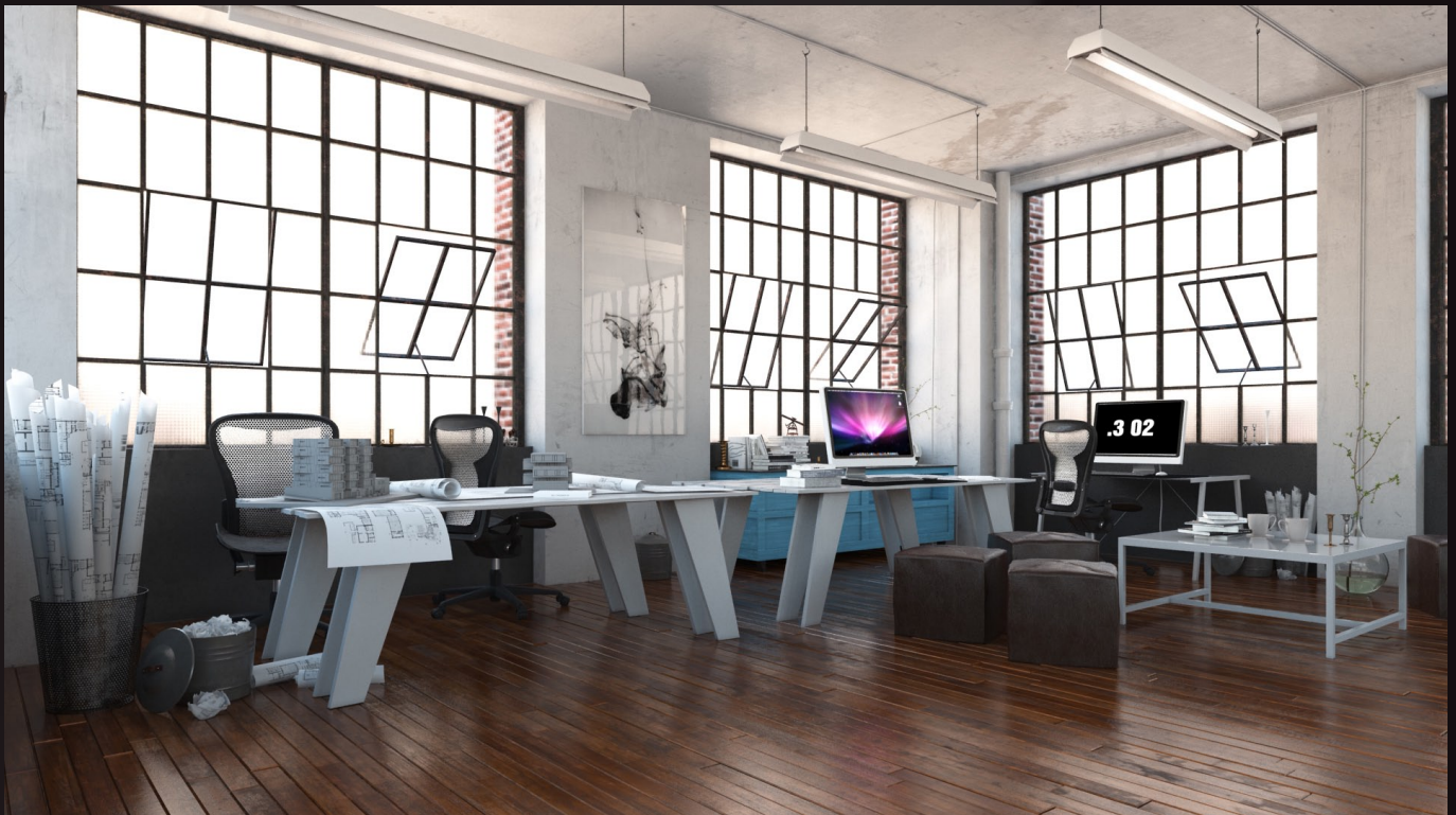
scene 05 raw

Have you ever wanted to make professional interior renderings? Do you know how to use V-RaySun, V-RaySky and V-RayPhysicalCamera? Have you ever had problems with composition? Archexteriors will end all your problems. Take a look at this 10 fully textured scenes with professional shaders and lighting ready to render. Get your own portfolio and join cg market.