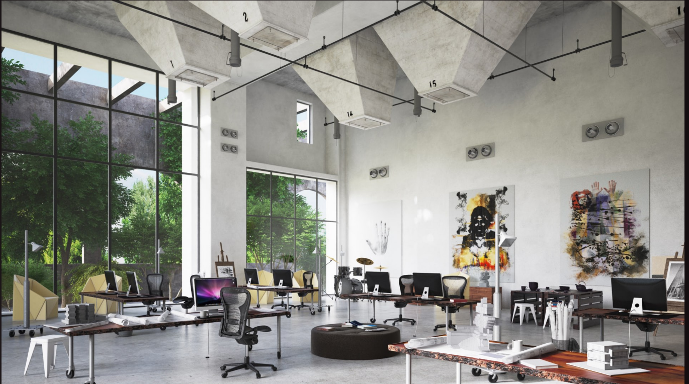
scene 10 raw

Have you ever wanted to make professional interior renderings? Do you know how to use V-RaySun, V-RaySky and V-RayPhysicalCamera? Have you ever had problems with composition? Archexteriors will end all your problems. Take a look at this 10 fully textured scenes with professional shaders and lighting ready to render. Get your own portfolio and join cg market.