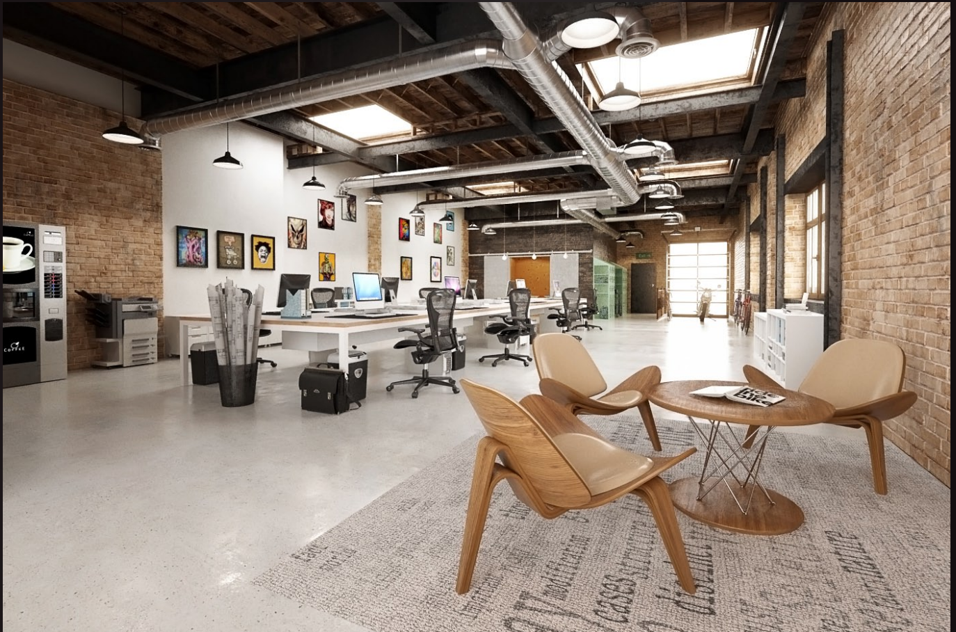
scene 08 post production

Have you ever wanted to make professional interior renderings? Do you know how to use V-RaySun, V-RaySky and V-RayPhysicalCamera? Have you ever had problems with composition? Archinteriors will end all your problems. Take a look at this 10 fully textured scenes with professional shaders and lighting ready to render. Get your own portfolio and join cg market.