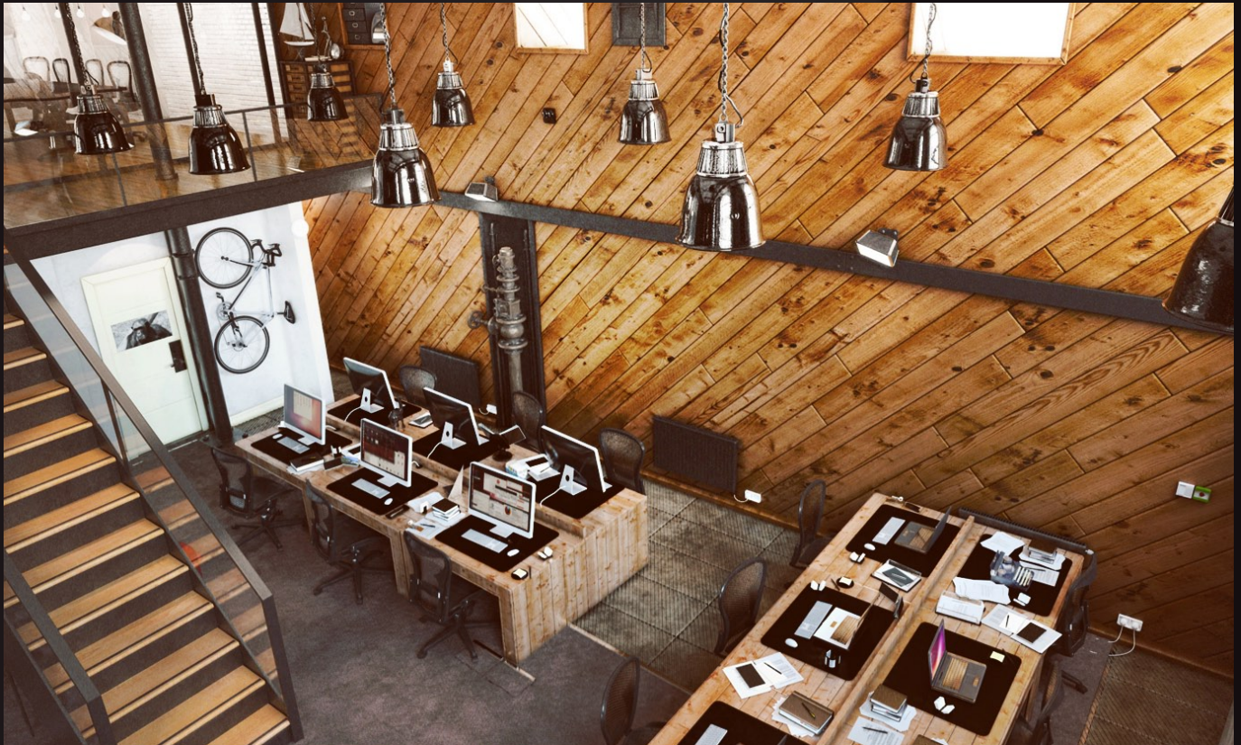
scene 01 post production

Have you ever wanted to make professional interior renderings? Do you know how to use V-RaySun, V-RaySky and V-RayPhysicalCamera? Have you ever had problems with composition? Archinteriors will end all your problems. Take a look at this 10 fully textured scenes with professional shaders and lighting ready to render. Get your own portfolio and join cg market.