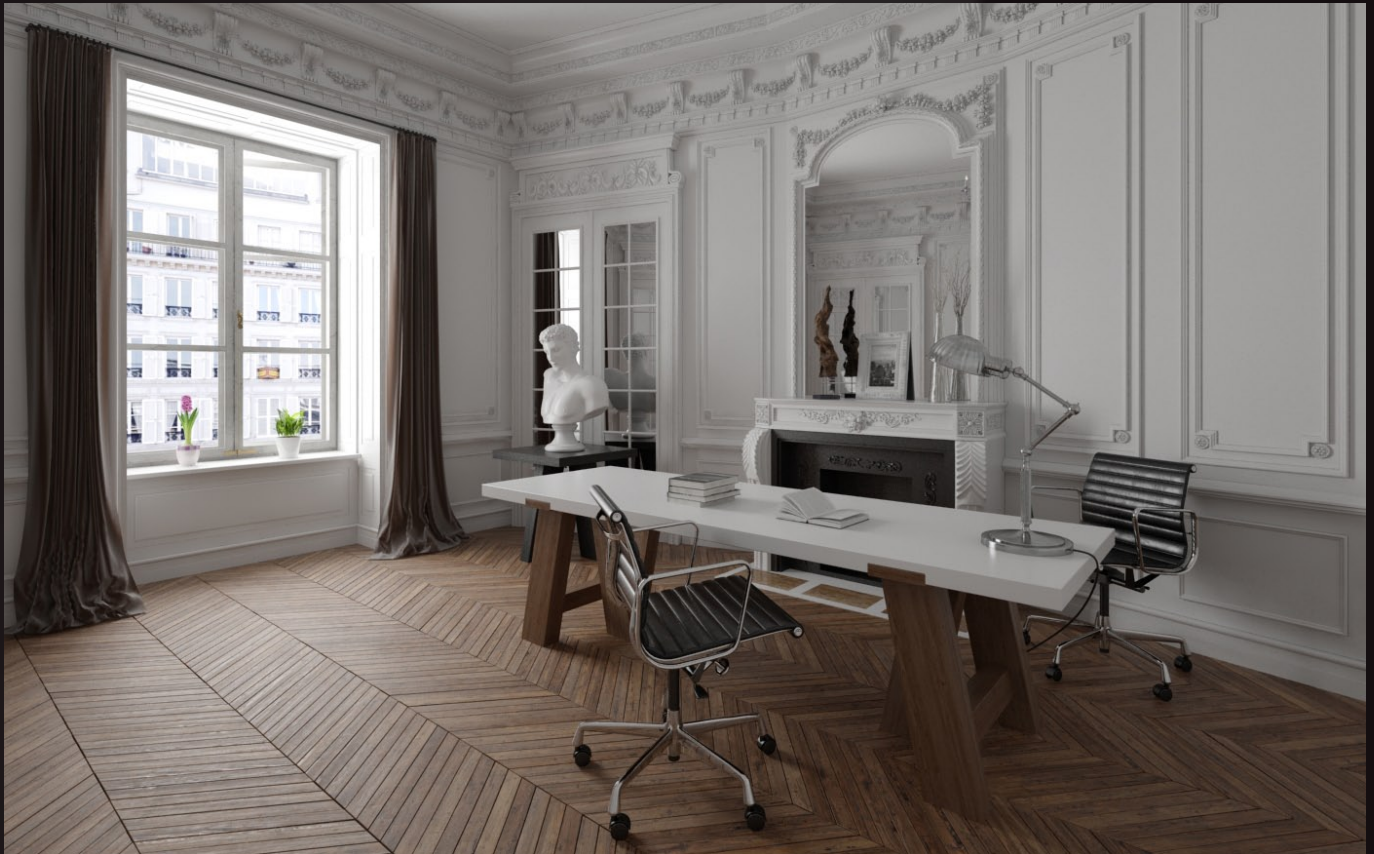
scene 04 raw

Have you ever wanted to make professional interior renderings? Do you know how to use V-RaySun, V-RaySky and V-RayPhysicalCamera? Have you ever had problems with composition? Archexteriors will end all your problems. Take a look at this 10 fully textured scenes with professional shaders and lighting ready to render. Get your own portfolio and join cg market.