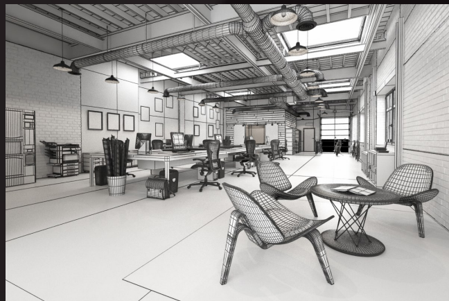
scene 08 wire

Software and models © 2014 EVERMOTION. EVERMOTION logo is trademark or registered trademark of Evermotion Inc. in the U.S. and/or other countries. All rights reserved. All *.max and bitmaps models included on this collection with data are an integral part of „archinteriors vol.32” and the resale of this data is strictly prohibited. All models can be used for commercial purposes only by owners who bought this collection. The sharing of collection is strictly prohibited unless that user has written authorization from EVERMOTION.