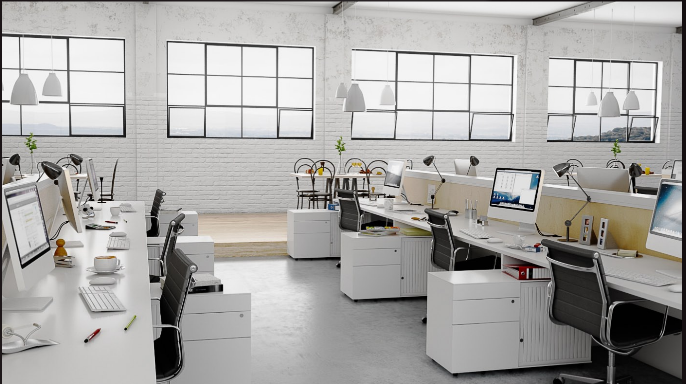
scene 02 post production

Have you ever wanted to make professional interior renderings? Do you know how to use V-RaySun, V-RaySky and V-RayPhysicalCamera? Have you ever had problems with composition? Archexteriors will end all your problems. Take a look at this 10 fully textured scenes with professional shaders and lighting ready to render. Get your own portfolio and join cg market.