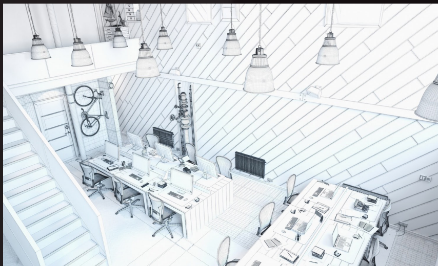
scene 01 wire

Software and models © 2014 EVERMOTION. EVERMOTION logo is trademark or registered trademark of Evermotion Inc. in the U.S. and/or other countries. All rights reserved. All *.max and bitmaps models included on this collection with data are an integral part of „archinteriors vol.32” and the resale of this data is strictly prohibited. All models can be used for commercial purposes only by owners who bought this collection. The sharing of collection is strictly prohibited unless that user has written authorization from EVERMOTION.