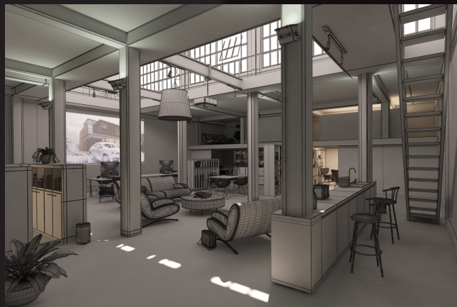
scene 09 wire

Software and models © 2014 EVERMOTION. EVERMOTION logo is trademark or registered trademark of Evermotion Inc. in the U.S. and/or other countries. All rights reserved. All *.max and bitmaps models included on this collection with data are an integral part of „archinteriors vol.32” and the resale of this data is strictly prohibited. All models can be used for commercial purposes only by owners who bought this collection. The sharing of collection is strictly prohibited unless that user has written authorizati on from EVERMOTION.