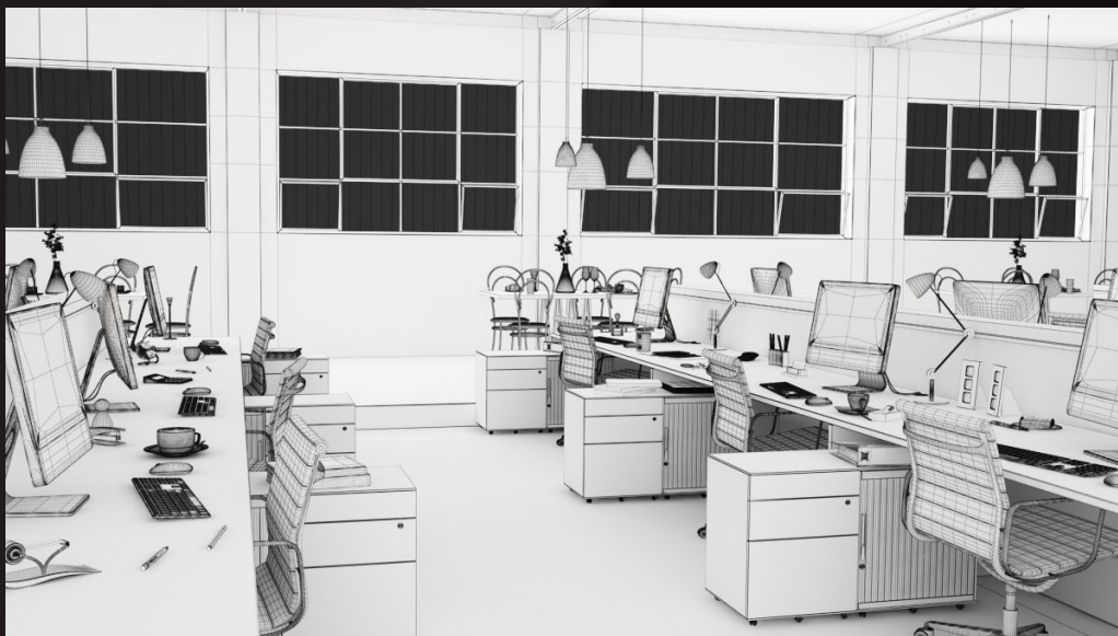
scene 02 wire

Software and models © 2014 EVERMOTION. EVERMOTION logo is trademark or registered trademark of Evermotion Inc. in the U.S. and/or other countries. All rights reserved. All *.max and bitmaps models included on this collection with data are an integral part of „archinteriors vol.32” and the resale of this data is strictly prohibited. All models can be used for commercial purposes only by owners who bought this collection. The sharing of collection is strictly prohibited unless that user has written authorization from EVERMOTION.