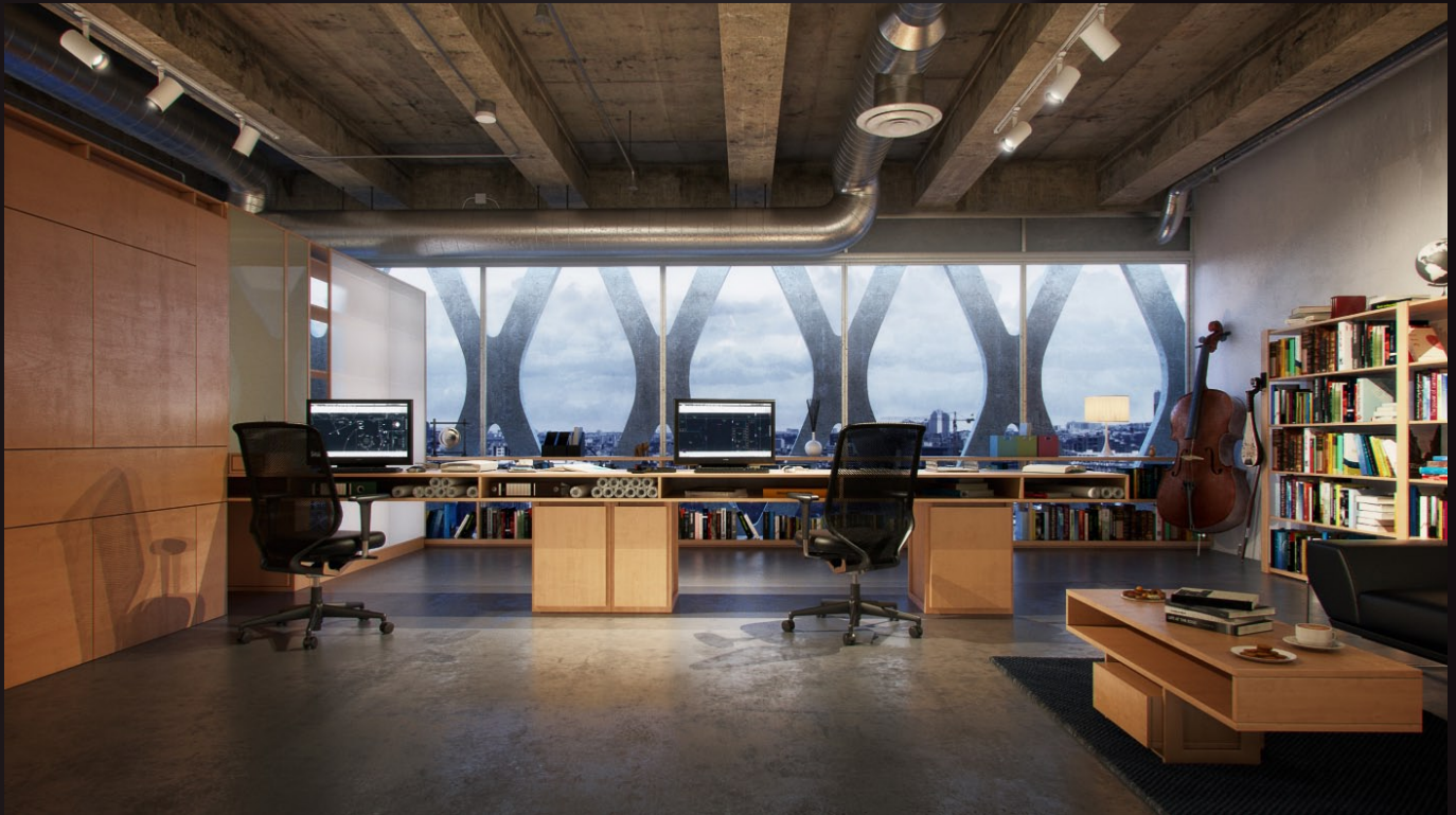
scene 03 post production

Have you ever wanted to make professional interior renderings? Do you know how to use V-RaySun, V-RaySky and V-RayPhysicalCamera? Have you ever had problems with composition? Archinteriors will end all your problems. Take a look at this 10 fully textured scenes with professional shaders and lighting ready to render. Get your own portfolio and join cg market.