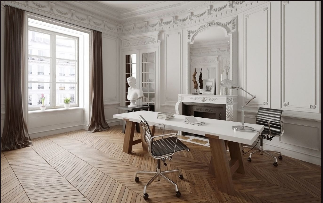
scene 04 post production

Have you ever wanted to make professional interior renderings? Do you know how to use V-RaySun, V-RaySky and V-RayPhysicalCamera? Have you ever had problems with composition? Archinteriors will end all your problems. Take a look at this 10 fully textured scenes with professional shaders and lighting ready to render. Get your own portfolio and join cg market.