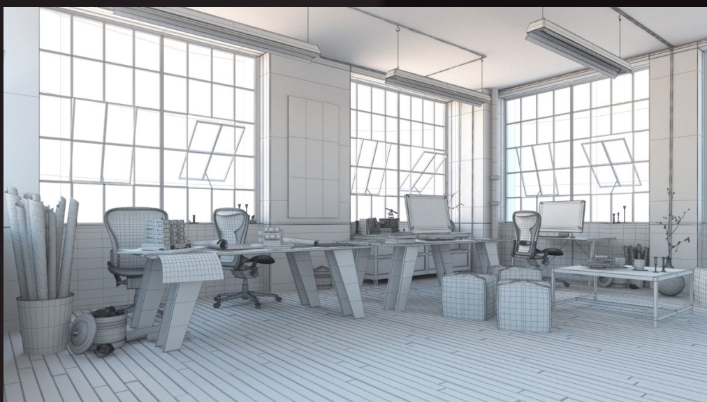
scene 05 wire

Software and models © 2014 EVERMOTION. EVERMOTION logo is trademark or registered trademark of Evermotion Inc. in the U.S. and/or other countries. All rights reserved. All *.max and bitmaps models included on this collection with data are an integral part of „archinteriors vol.32” and the resale of this data is strictly prohibited. All models can be used for commercial purposes only by owners who bought this collection. The sharing of collection is strictly prohibited unless that user has written authorizati on from EVERMOTION.