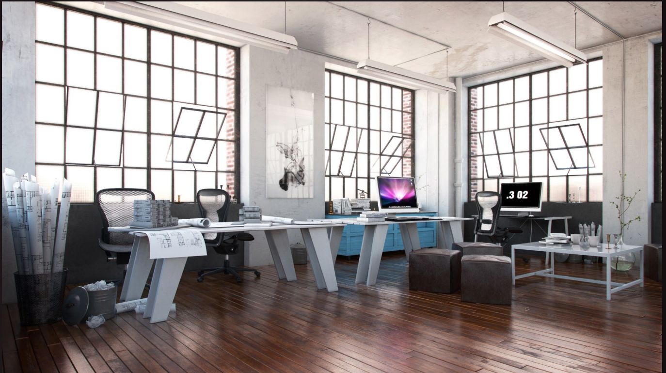
scene 05 post production

Have you ever wanted to make professional interior renderings? Do you know how to use V-RaySun, V-RaySky and V-RayPhysicalCamera? Have you ever had problems with composition? Archinteriors will end all your problems. Take a look at this 10 fully textured scenes with professional shaders and lighting ready to render. Get your own portfolio and join cg market.