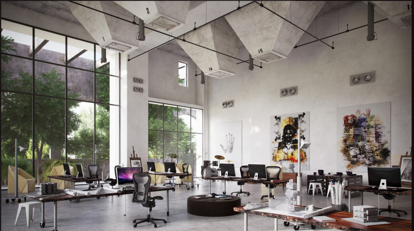
scene 10 post production

Have you ever wanted to make professional interior renderings? Do you know how to use V-RaySun, V-RaySky and V-RayPhysicalCamera? Have you ever had problems with composition? Archexteriors will end all your problems. Take a look at this 10 fully textured scenes with professional shaders and lighting ready to render. Get your own portfolio and join cg market.