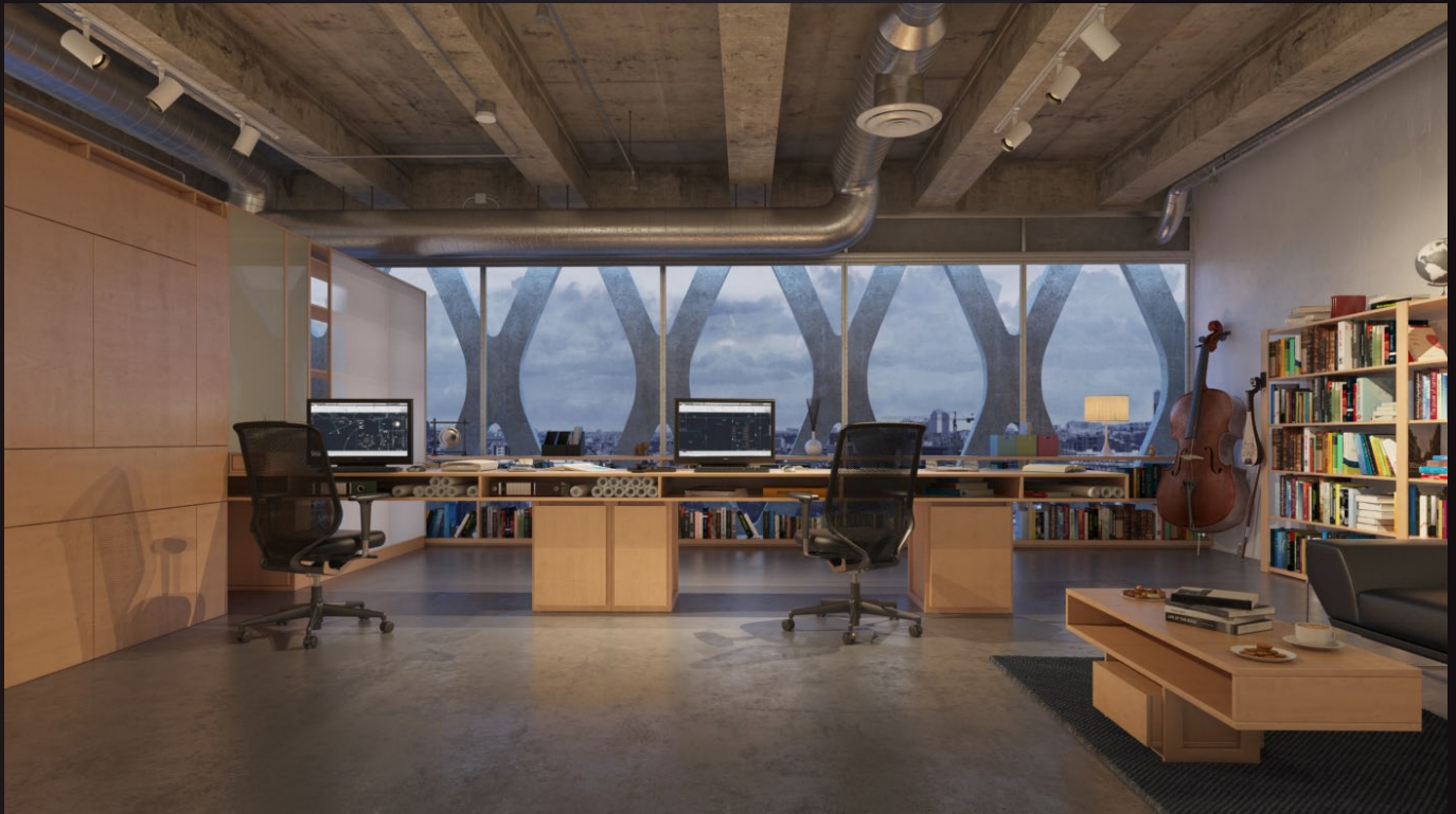
scene 03 raw

Have you ever wanted to make professional interior renderings? Do you know how to use V-RaySun, V-RaySky and V-RayPhysicalCamera? Have you ever had problems with composition? Archexteriors will end all your problems. Take a look at this 10 fully textured scenes with professional shaders and lighting ready to render. Get your own portfolio and join cg market.