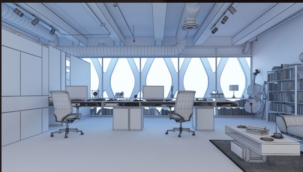
scene 03 wire

Software and models © 2014 EVERMOTION. EVERMOTION logo is trademark or registered trademark of Evermotion Inc. in the U.S. and/or other countries. All rights reserved. All *.max and bitmaps models included on this collection with data are an integral part of „archinteriors vol.32” and the resale of this data is strictly prohibited. All models can be used for commercial purposes only by owners who bought this collection. The sharing of collection is strictly prohibited unless that user has written authorizati on from EVERMOTION.