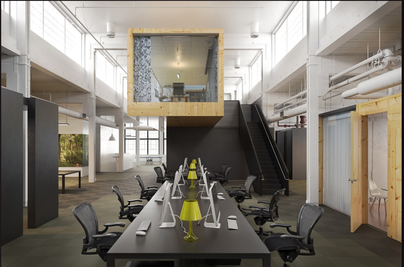
scene 07 post production

Have you ever wanted to make professional interior renderings? Do you know how to use V-RaySun, V-RaySky and V-RayPhysicalCamera? Have you ever had problems with composition? Archexteriors will end all your problems. Take a look at this 10 fully textured scenes with professional shaders and lighting ready to render. Get your own portfolio and join cg market.