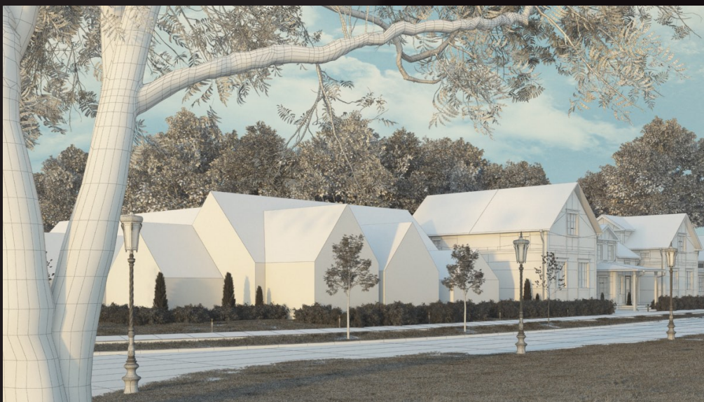
scene 04 wire

Software and models © 2014 EVERMOTION. EVERMOTION logo is trademark or registered trademark of Evermotion Inc. in the U.S. and/or other countries. All rights reserved. All *.max and bitmaps models included on this collection with data are an integral part of „archexteriors vol.24” and the resale of this data is strictly prohibited. All models can be used for commercial purposes only by owners who bought this collection. The sharing of collection data is strictly prohibited unless that user has written authorization from EVERMOTION.