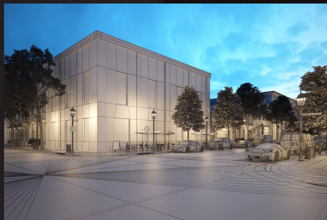
scene 06 wire

Software and models © 2014 EVERMOTION. EVERMOTION logo is trademark or registered trademark of Evermotion Inc. in the U.S. and/or other countries. All rights reserved. All *.max and bitmaps models included on this collection with data are an integral part of „archexteriors vol.24” and the resale of this data is strictly prohibited. All models can be used for commercial purposes only by owners who bought this collection. The sharing of collection data is strictly prohibited unless that user has written authorization from EVERMOTION.