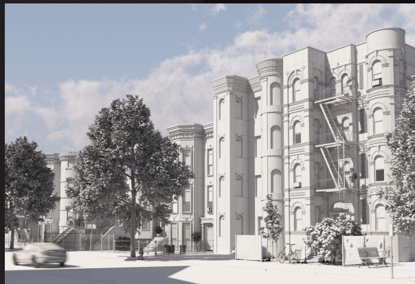
scene 07 wire

Software and models © 2014 EVERMOTION. EVERMOTION logo is trademark or registered trademark of Evermotion Inc. in the U.S. and/or other countries. All rights reserved. All *.max and bitmaps models included on this collection with data are an integral part of „archexteriors vol.24” and the resale of this data is strictly prohibited. All models can be used for commercial purposes only by owners who bought this collection. The sharing of collection data is strictly prohibited unless that user has written authorization from EVERMOTION.