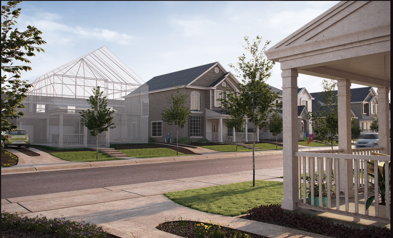
scene 03 render

Have you ever wanted to make professional exterior renderings? Do you know how to use V-RaySun, V-RaySky and V-RayPhysicalCamera? Have you ever had problems with composition? Archexteriors will end all your problems. Take a look at this 10 fully textured scenes with professional shaders and lighting ready to render. Get your own portfolio and join cg market.