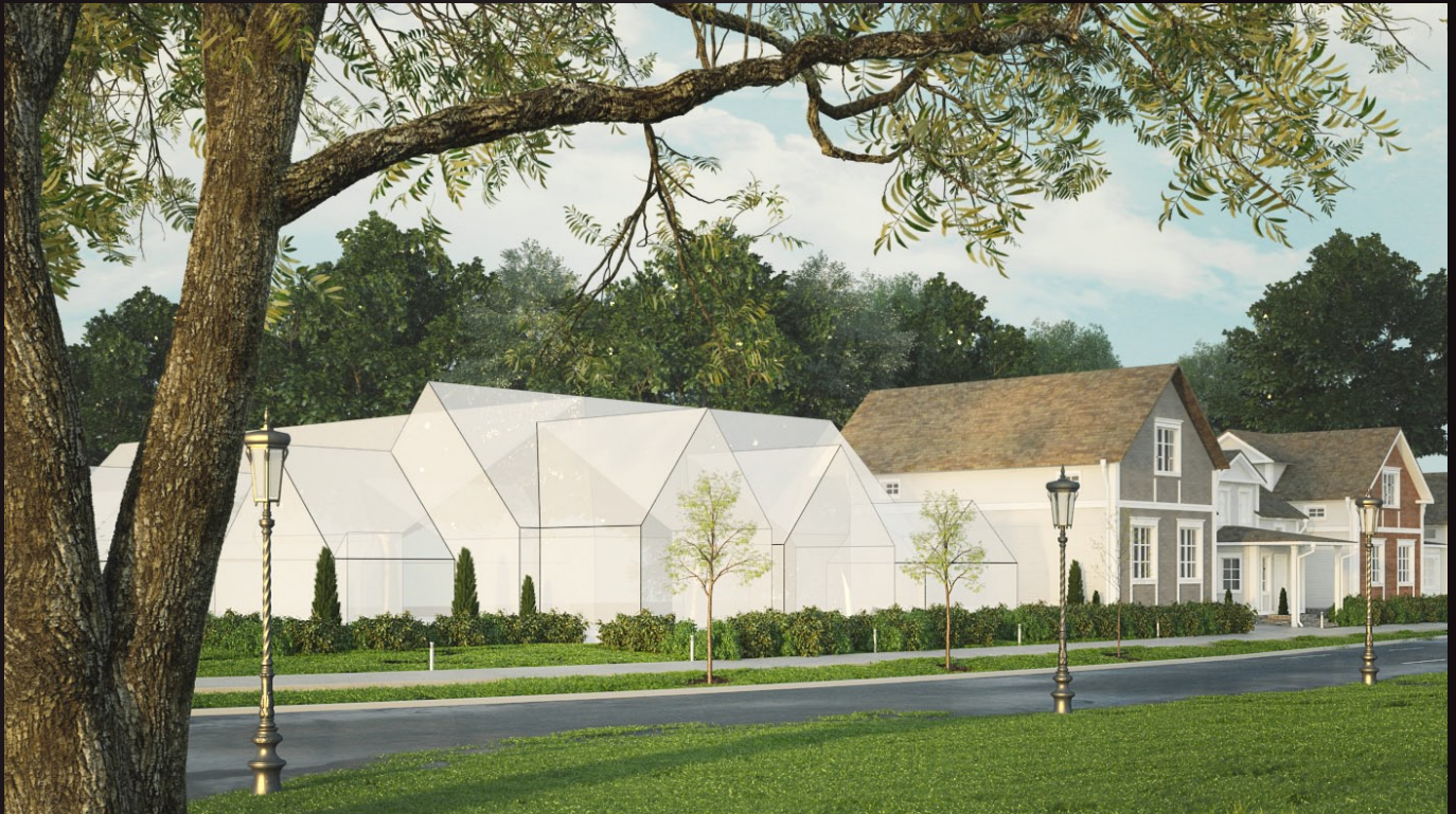
scene 04 render

Have you ever wanted to make professional exterior renderings? Do you know how to use V-RaySun, V-RaySky and V-RayPhysicalCamera? Have you ever had problems with composition? Archexteriors will end all your problems. Take a look at this 10 fully textured scenes with professional shaders and lighting ready to render. Get your own portfolio and join cg market.