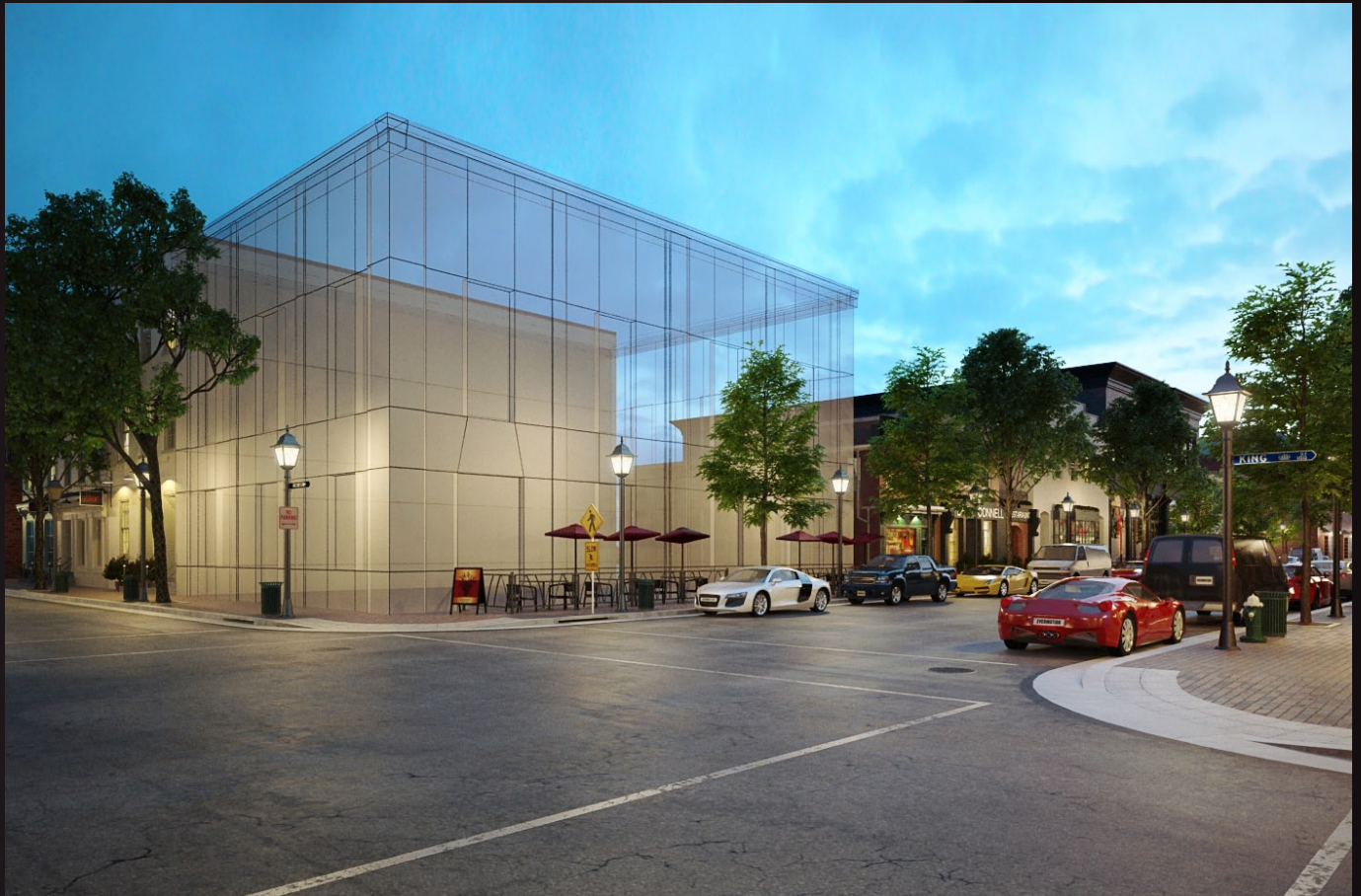
scene 06 render

Have you ever wanted to make professional exterior renderings? Do you know how to use V-RaySun, V-RaySky and V-RayPhysicalCamera? Have you ever had problems with composition? Archexteriors will end all your problems. Take a look at this 10 fully textured scenes with professional shaders and lighting ready to render. Get your own portfolio and join cg market.