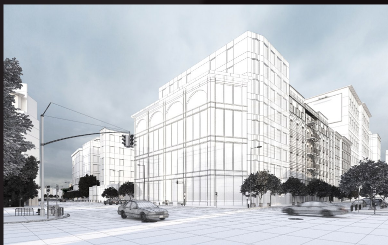
scene 05 wire

Software and models © 2014 EVERMOTION. EVERMOTION logo is trademark or registered trademark of Evermotion Inc. in the U.S. and/or other countries. All rights reserved. All *.max and bitmaps models included on this collection with data are an integral part of „archexteriors vol.24” and the resale of this data is strictly prohibited. All models can be used for commercial purposes only by owners who bought this collection. The sharing of collection data is strictly prohibited unless that user has written authorization from EVERMOTION.