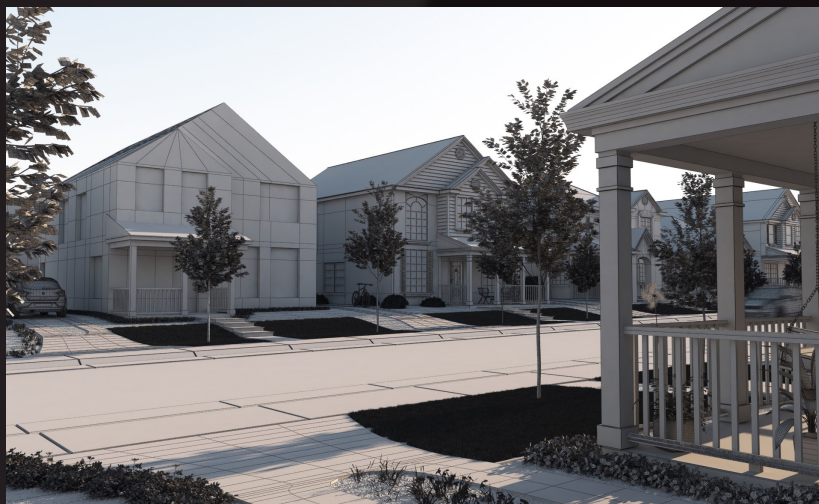
scene 03 wire

Software and models © 2014 EVERMOTION. EVERMOTION logo is trademark or registered trademark of Evermotion Inc. in the U.S. and/or other countries. All rights reserved. All *.max and bitmaps models included on this collection with data are an integral part of „archexteriors vol.24” and the resale of this data is strictly prohibited. All models can be used for commercial purposes only by owners who bought this collection. The sharing of collection data is strictly prohibited unless that user has written authorization from EVERMOTION.