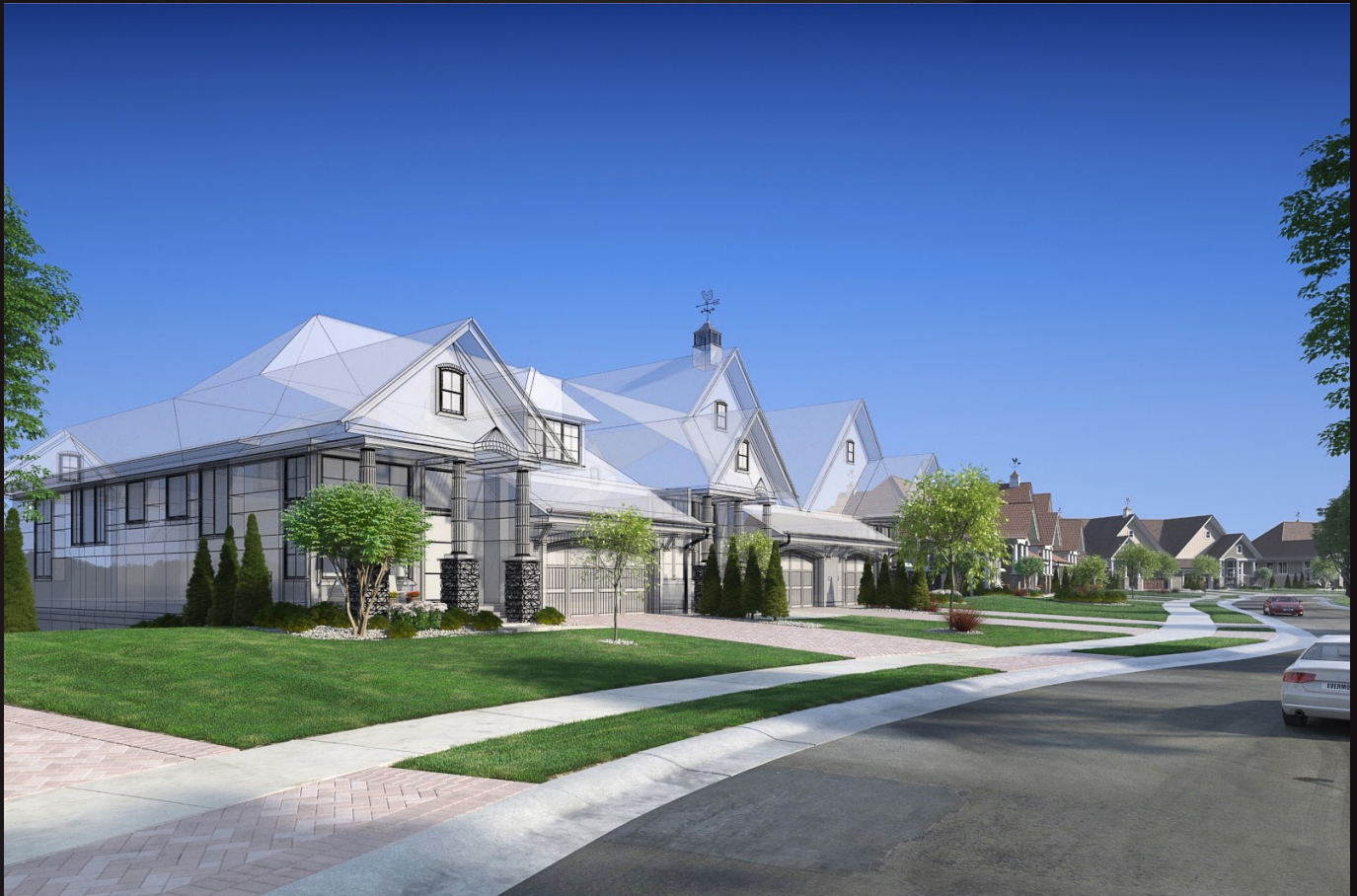
scene 01 render

Have you ever wanted to make professional exterior renderings? Do you know how to use V-RaySun, V-RaySky and V-RayPhysicalCamera? Have you ever had problems with composition? Archexteriors will end all your problems. Take a look at this 10 fully textured scenes with professional shaders and lighting ready to render. Get your own portfolio and join cg market.