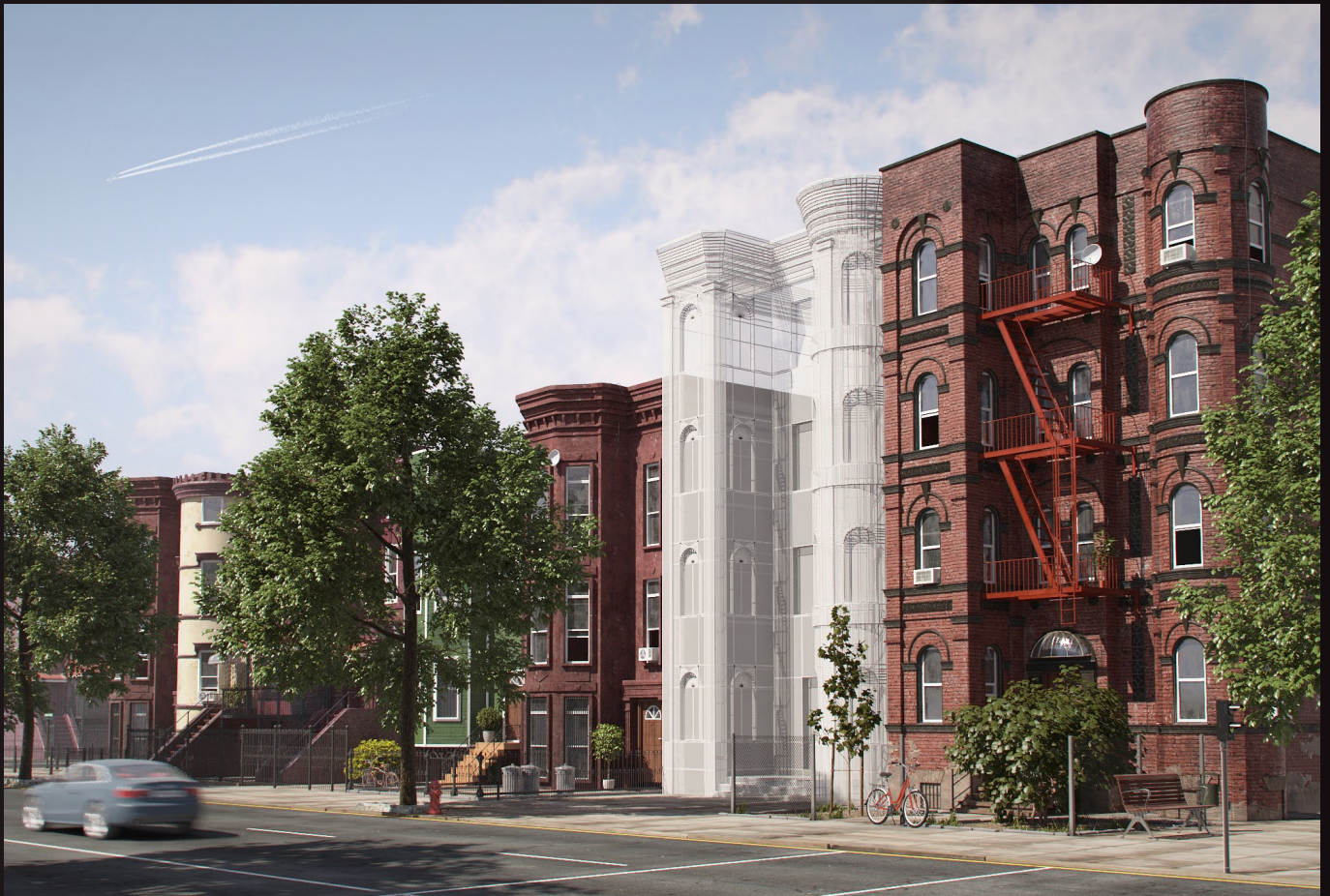
scene 07 render

Have you ever wanted to make professional exterior renderings? Do you know how to use V-RaySun, V-RaySky and V-RayPhysicalCamera? Have you ever had problems with composition? Archexteriors will end all your problems. Take a look at this 10 fully textured scenes with professional shaders and lighting ready to render. Get your own portfolio and join cg market.