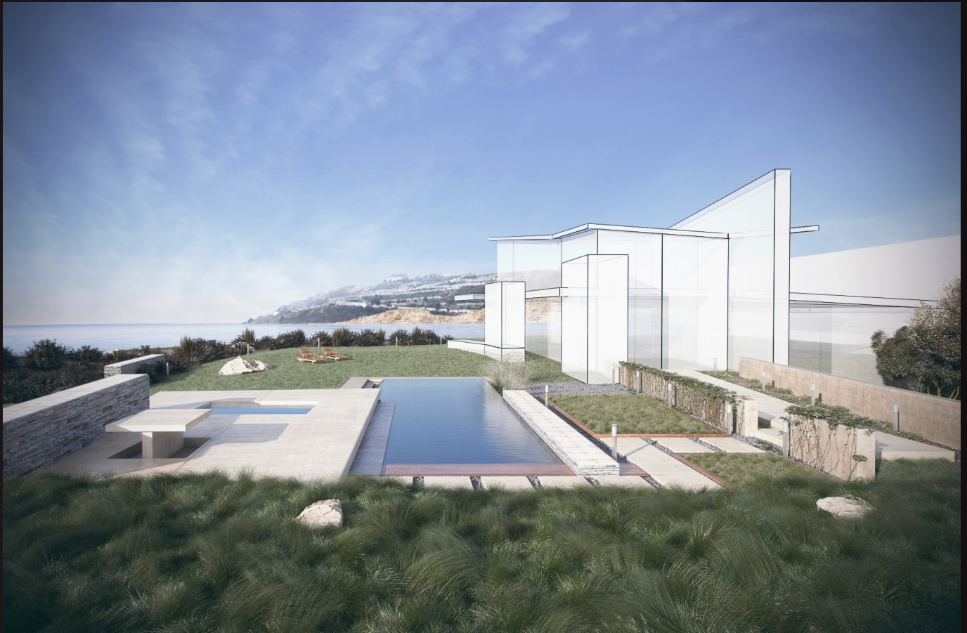
scene 10 render

Have you ever wanted to make professional exterior renderings? Do you know how to use V-RaySun, V-RaySky and V-RayPhysicalCamera? Have you ever had problems with composition? Archexteriors will end all your problems. Take a look at this 10 fully textured scenes with professional shaders and lighting ready to render. Get your own portfolio and join cg market.