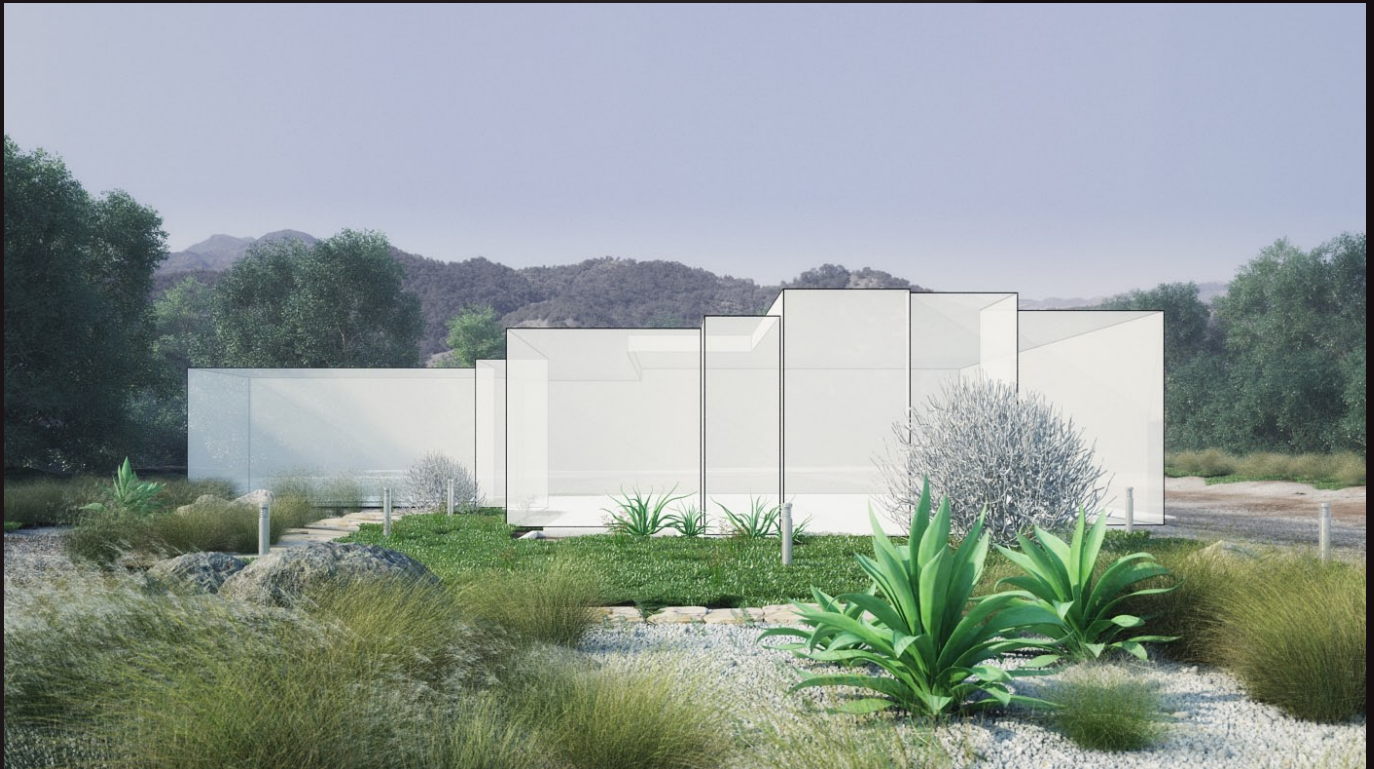
scene 08 render

Have you ever wanted to make professional exterior renderings? Do you know how to use V-RaySun, V-RaySky and V-RayPhysicalCamera? Have you ever had problems with composition? Archexteriors will end all your problems. Take a look at this 10 fully textured scenes with professional shaders and lighting ready to render. Get your own portfolio and join cg market.