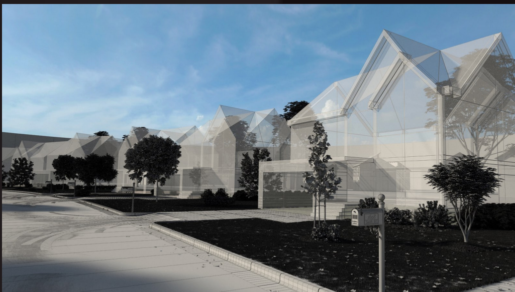
scene 02 wire

Software and models © 2014 EVERMOTION. EVERMOTION logo is trademark or registered trademark of Evermotion Inc. in the U.S. and/or other countries. All rights reserved. All *.max and bitmaps models included on this collection with data are an integral part of „archexteriors vol.24” and the resale of this data is strictly prohibited. All models can be used for commercial purposes only by owners who bought this collection. The sharing of collection data is strictly prohibited unless that user has written authorization from EVERMOTION.