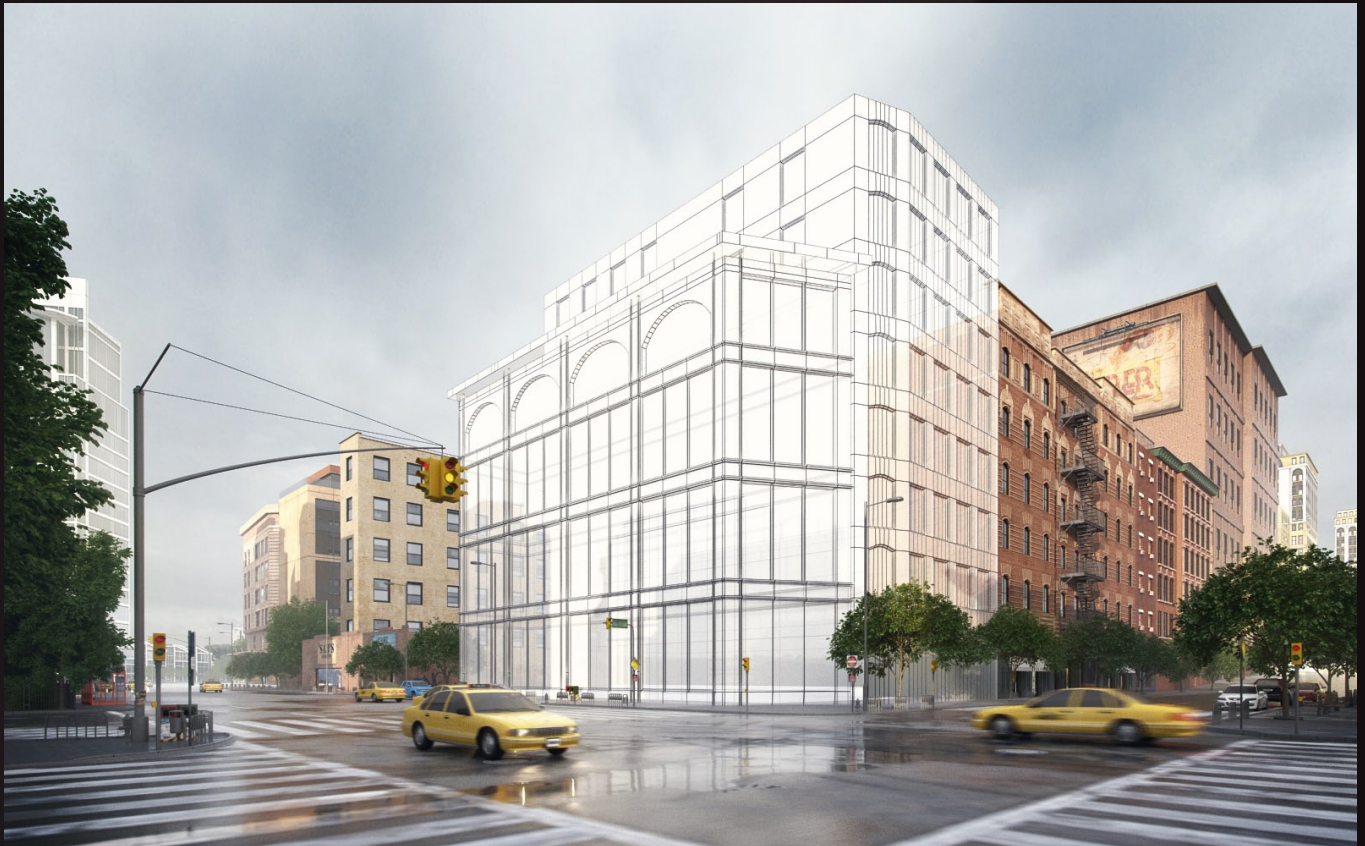
scene 05 render

Have you ever wanted to make professional exterior renderings? Do you know how to use V-RaySun, V-RaySky and V-RayPhysicalCamera? Have you ever had problems with composition? Archexteriors will end all your problems. Take a look at this 10 fully textured scenes with professional shaders and lighting ready to render. Get your own portfolio and join cg market.