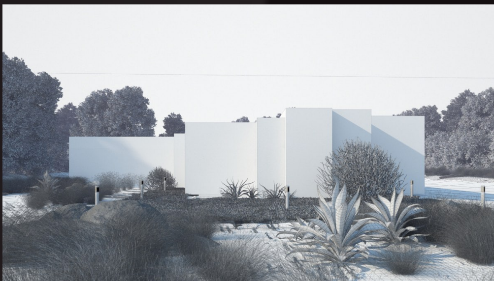
scene 08 wire

Software and models © 2014 EVERMOTION. EVERMOTION logo is trademark or registered trademark of Evermotion Inc. in the U.S. and/or other countries. All rights reserved. All *.max and bitmaps models included on this collection with data are an integral part of „archexteriors vol.24” and the resale of this data is strictly prohibited. All models can be used for commercial purposes only by owners who bought this collection. The sharing of collection data is strictly prohibited unless that user has written authorization from EVERMOTION.