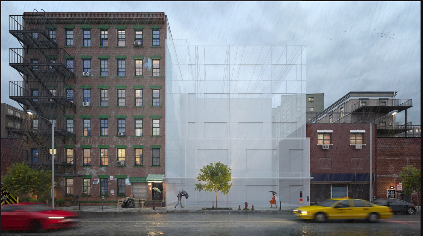
scene 09 render

Have you ever wanted to make professional exterior renderings? Do you know how to use V-RaySun, V-RaySky and V-RayPhysicalCamera? Have you ever had problems with composition? Archexteriors will end all your problems. Take a look at this 10 fully textured scenes with professional shaders and lighting ready to render. Get your own portfolio and join cg market.