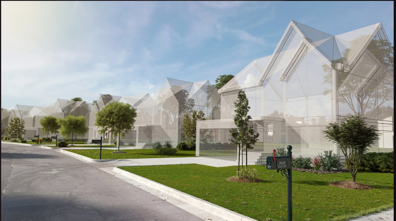
scene 02 render

Have you ever wanted to make professional exterior renderings? Do you know how to use V-RaySun, V-RaySky and V-RayPhysicalCamera? Have you ever had problems with composition? Archexteriors will end all your problems. Take a look at this 10 fully textured scenes with professional shaders and lighting ready to render. Get your own portfolio and join cg market.