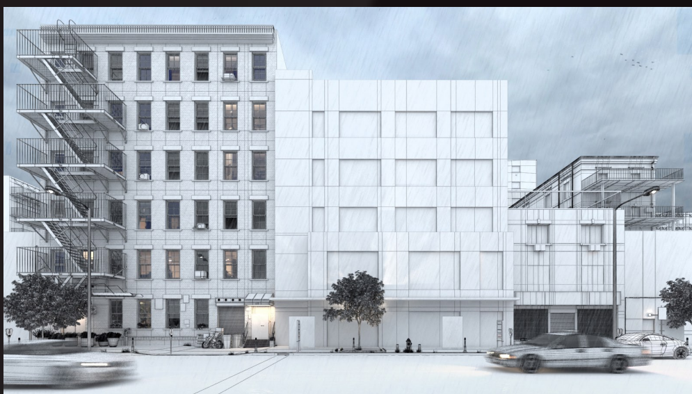
scene 09 wire

Software and models © 2014 EVERMOTION. EVERMOTION logo is trademark or registered trademark of Evermotion Inc. in the U.S. and/or other countries. All rights reserved. All *.max and bitmaps models included on this collection with data are an integral part of „archexteriors vol.24” and the resale of this data is strictly prohibited. All models can be used for commercial purposes only by owners who bought this collection. The sharing of collection data is strictly prohibited unless that user has written authorization from EVERMOTION.