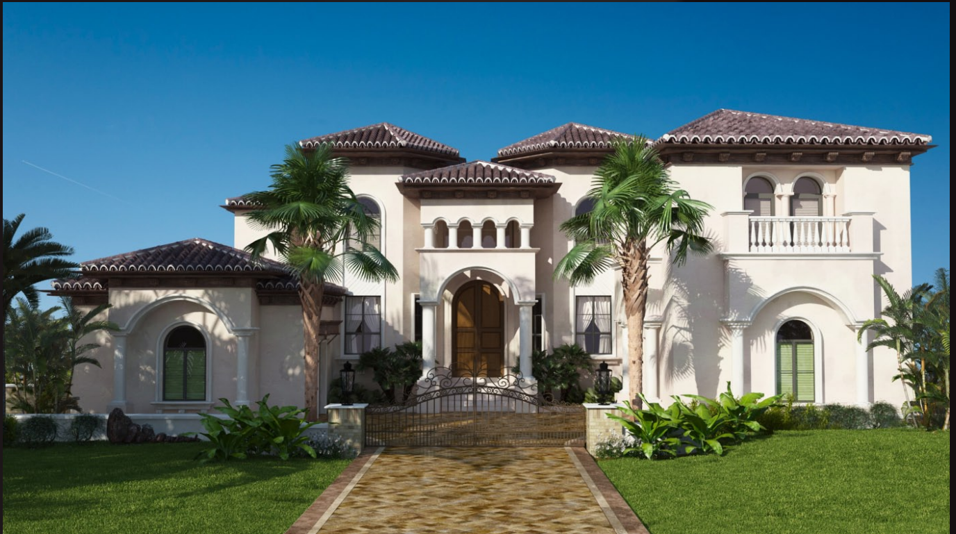
scene 10 render

Have you ever wanted to make professional exterior renderings? Do you know how to use V-RaySun, V-RaySky and V-RayPhysicalCamera? Have you ever had problems with composition? Archexteriors will end all your problems. Take a look at this 10 fully textured scenes with professional shaders and lighting ready to render. Get your own portfolio and join cg market.