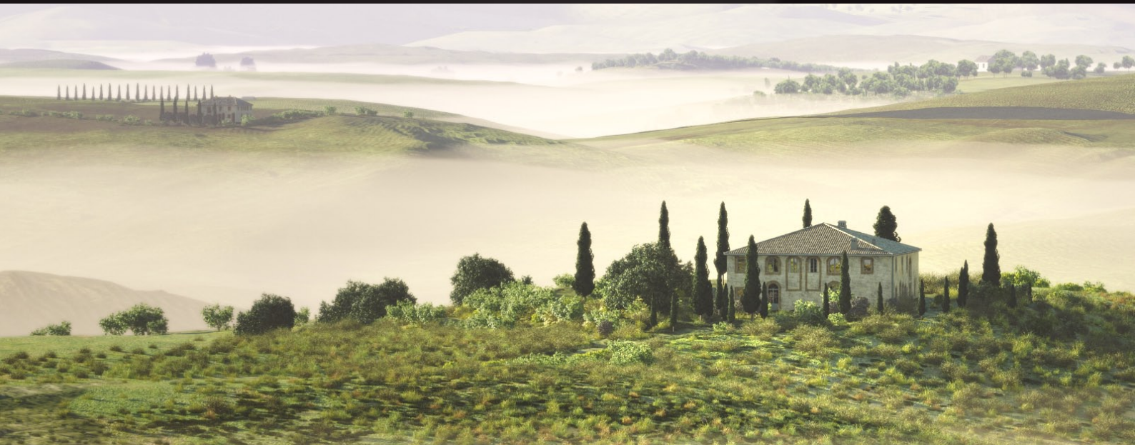
scene 04 post-production

Have you ever wanted to make professional exterior renderings? Do you know how to use V-RaySun, V-RaySky and V-RayPhysicalCamera? Have you ever had problems with composition? Archexteriors will end all your problems. Take a look at this 10 fully textured scenes with professional shaders and lighting ready to render. Get your own portfolio and join cg market.