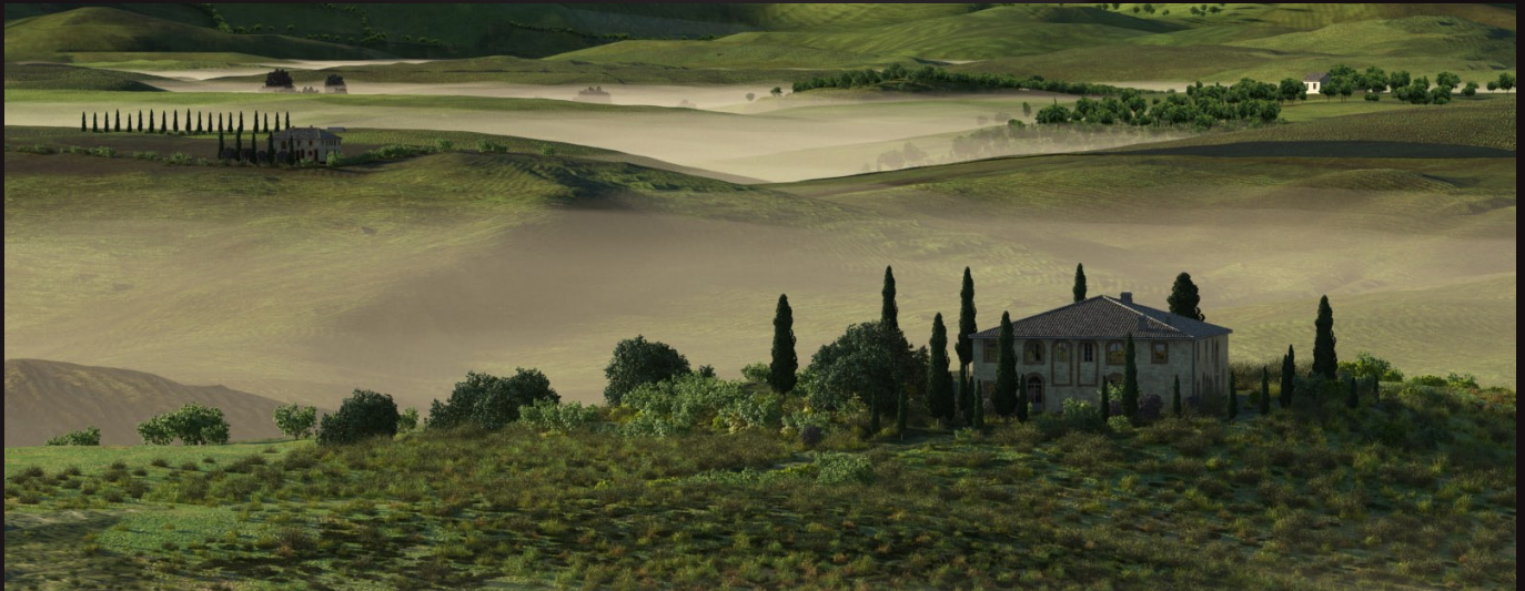
scene 04 render

Have you ever wanted to make professional exterior renderings? Do you know how to use V-RaySun, V-RaySky and V-RayPhysicalCamera? Have you ever had problems with composition? Archexteriors will end all your problems. Take a look at this 10 fully textured scenes with professional shaders and lighting ready to render. Get your own portfolio and join cg market.