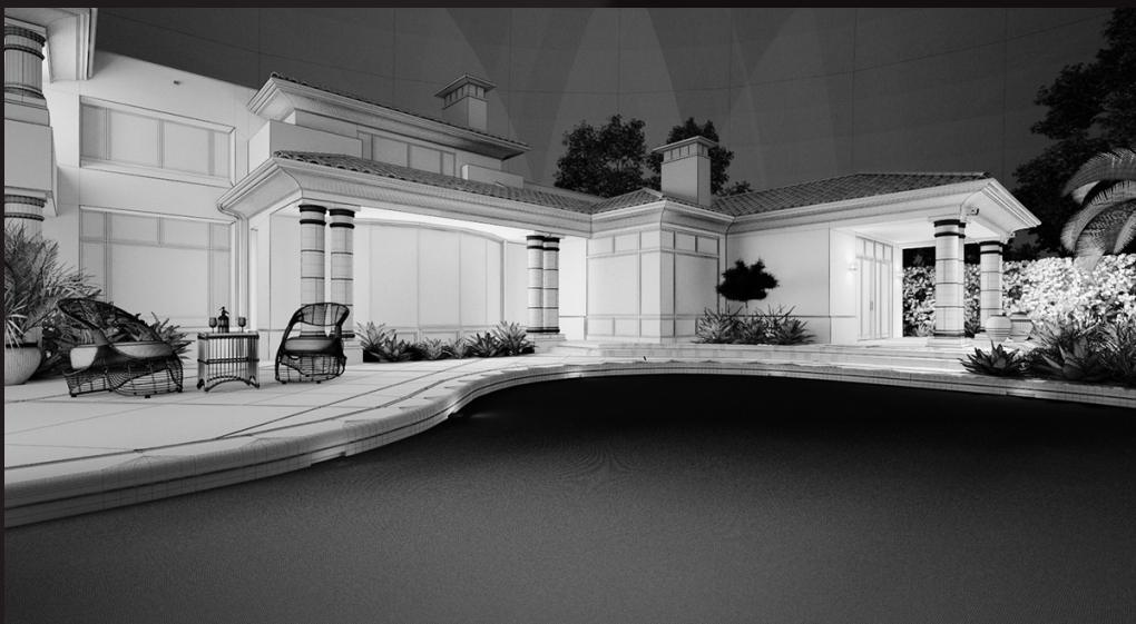
scene 06 wire

Software and models © 2014 EVERMOTION. EVERMOTION logo is trademark or registered trademark of Evermotion Inc. in the U.S. and/or other countries. All rights reserved. All *.max and bitmaps models included on this collection with data are an integral part of „archexteriors vol.21” and the resale of this data is strictly prohibited. All models can be used for commercial purposes only by owners who bought this collection. The sharing of collection data is strictly prohibited unless that user has written authorization from EVERMOTION.