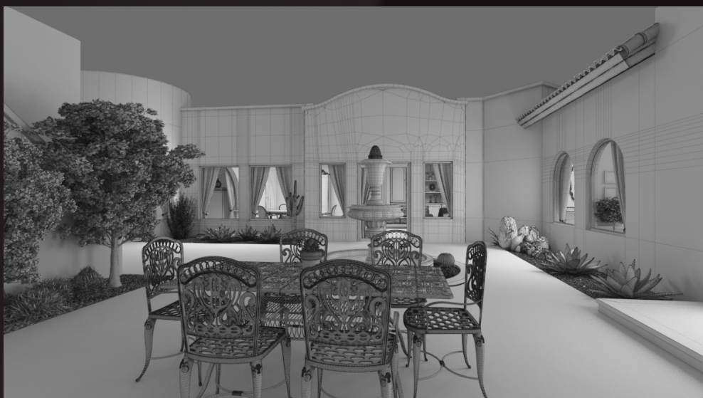
scene 01 wire

Software and models © 2014 EVERMOTION. EVERMOTION logo is trademark or registered trademark of Evermotion Inc. in the U.S. and/or other countries. All rights reserved. All *.max and bitmaps models included on this collection with data are an integral part of „archexteriors vol.21” and the resale of this data is strictly prohibited. All models can be used for commercial purposes only by owners who bought this collection. The sharing of collection data is strictly prohibited unless that user has written authorization from EVERMOTION.