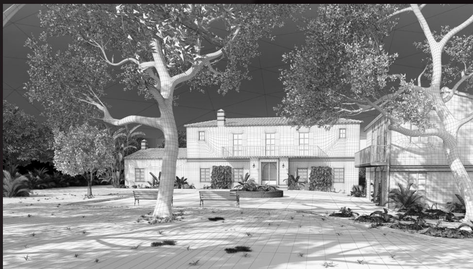
scene 08 wire

Software and models © 2014 EVERMOTION. EVERMOTION logo is trademark or registered trademark of Evermotion Inc. in the U.S. and/or other countries. All rights reserved. All *.max and bitmaps models included on this collection with data are an integral part of „archexteriors vol.21” and the resale of this data is strictly prohibited. All models can be used for commercial purposes only by owners who bought this collection. The sharing of collection data is strictly prohibited unless that user has written authorization from EVERMOTION.