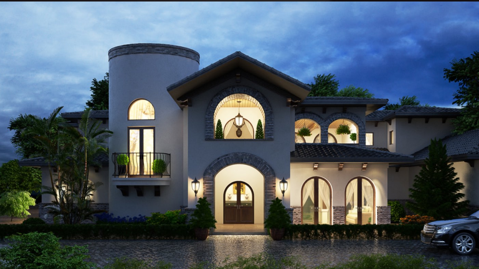
scene 02 post-production

Have you ever wanted to make professional exterior renderings? Do you know how to use V-RaySun, V-RaySky and V-RayPhysicalCamera? Have you ever had problems with composition? Archexteriors will end all your problems. Take a look at this 10 fully textured scenes with professional shaders and lighting ready to render. Get your own portfolio and join cg market.