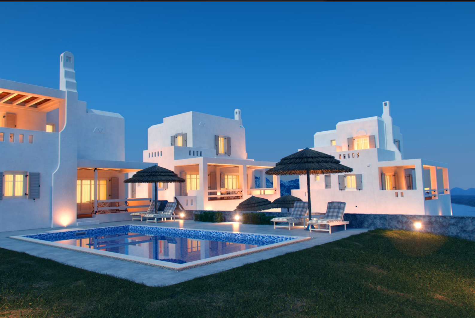
scene 03 post-production

Have you ever wanted to make professional exterior renderings? Do you know how to use V-RaySun, V-RaySky and V-RayPhysicalCamera? Have you ever had problems with composition? Archexteriors will end all your problems. Take a look at this 10 fully textured scenes with professional shaders and lighting ready to render. Get your own portfolio and join cg market.