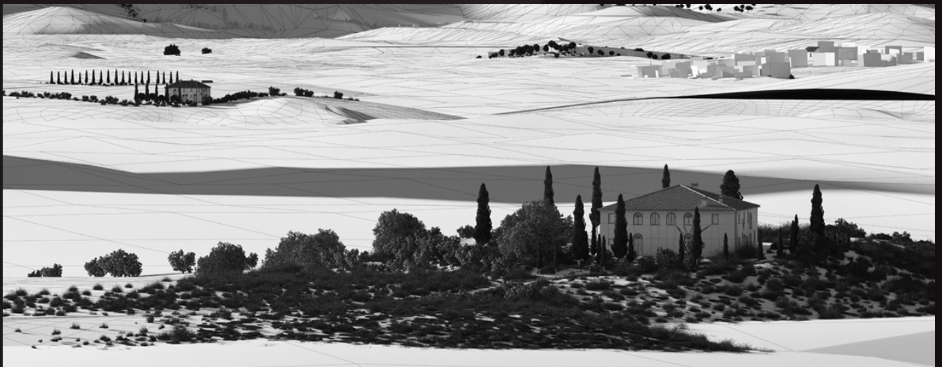
scene 04 wire

Software and models © 2014 EVERMOTION. EVERMOTION logo is trademark or registered trademark of Evermotion Inc. in the U.S. and/or other countries. All rights reserved. All *.max and bitmaps models included on this collection with data are an integral part of „archexteriors vol.21” and the resale of this data is strictly prohibited. All models can be used for commercial purposes only by owners who bought this collection. The sharing of collection data is strictly prohibited unless that user has written authorization from EVERMOTION.