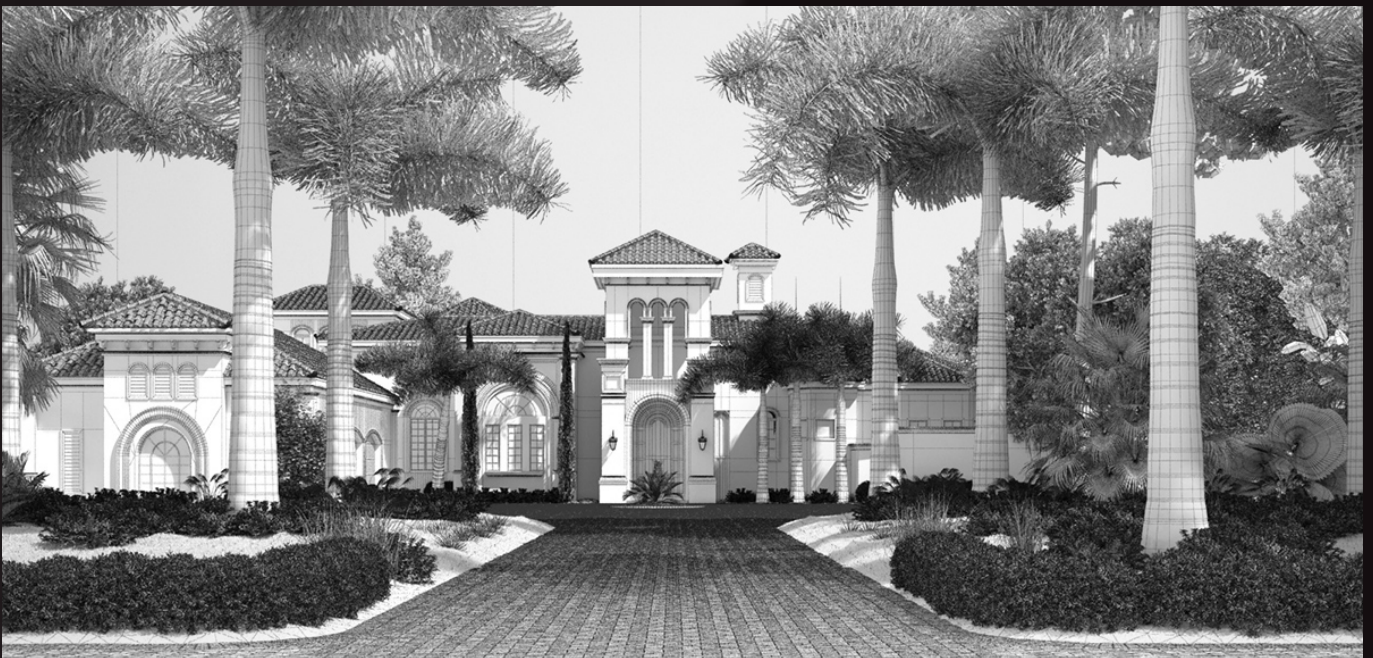
scene 07 wire

Software and models © 2014 EVERMOTION. EVERMOTION logo is trademark or registered trademark of Evermotion Inc. in the U.S. and/or other countries. All rights reserved. All *.max and bitmaps models included on this collection with data are an integral part of „archexteriors vol.21” and the resale of this data is strictly prohibited. All models can be used for commercial purposes only by owners who bought this collection. The sharing of collection data is strictly prohibited unless that user has written authorization from EVERMOTION.