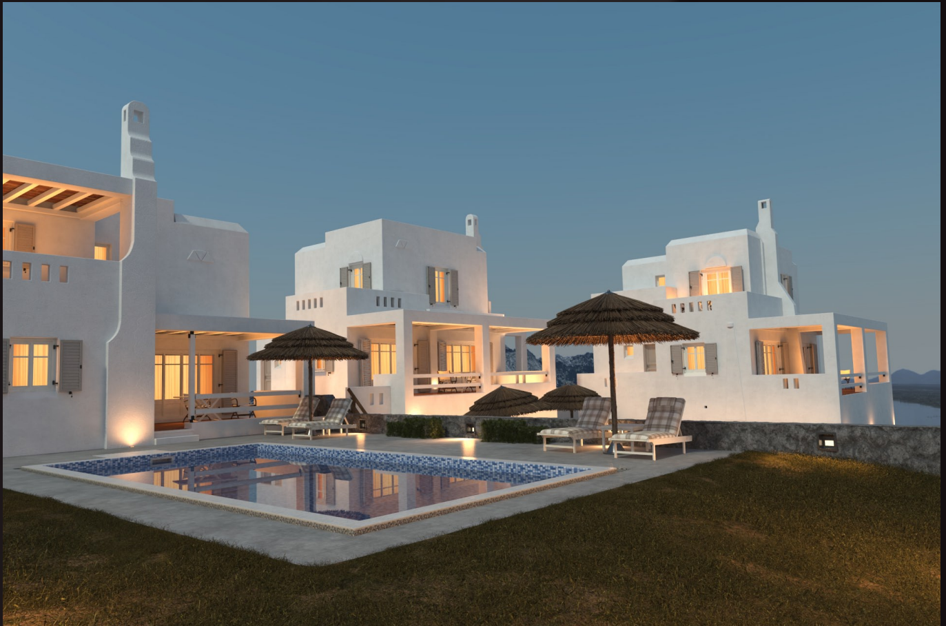
scene 03 render

Have you ever wanted to make professional exterior renderings? Do you know how to use V-RaySun, V-RaySky and V-RayPhysicalCamera? Have you ever had problems with composition? Archexteriors will end all your problems. Take a look at this 10 fully textured scenes with professional shaders and lighting ready to render. Get your own portfolio and join cg market.