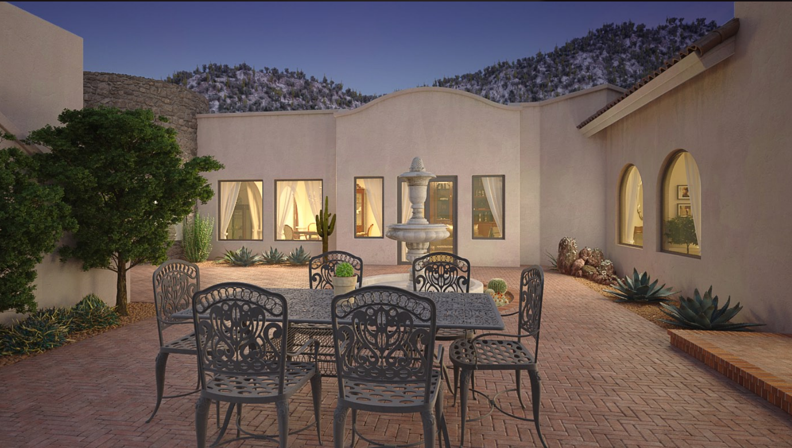
scene 01 post-production

Have you ever wanted to make professional exterior renderings? Do you know how to use V-RaySun, V-RaySky and V-RayPhysicalCamera? Have you ever had problems with composition? Archexteriors will end all your problems. Take a look at this 10 fully textured scenes with professional shaders and lighting ready to render. Get your own portfolio and join cg market.