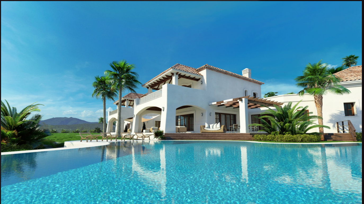
scene 09 render

Have you ever wanted to make professional exterior renderings? Do you know how to use V-RaySun, V-RaySky and V-RayPhysicalCamera? Have you ever had problems with composition? Archexteriors will end all your problems. Take a look at this 10 fully textured scenes with professional shaders and lighting ready to render. Get your own portfolio and join cg market.