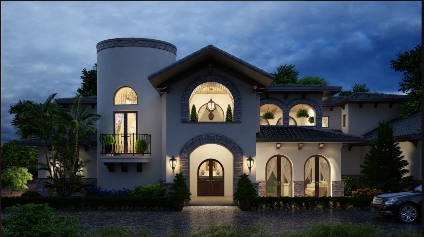
scene 02 render

Have you ever wanted to make professional exterior renderings? Do you know how to use V-RaySun, V-RaySky and V-RayPhysicalCamera? Have you ever had problems with composition? Archexteriors will end all your problems. Take a look at this 10 fully textured scenes with professional shaders and lighting ready to render. Get your own portfolio and join cg market.