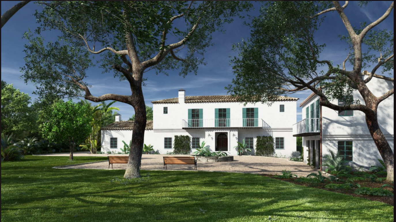
scene 08 render

Have you ever wanted to make professional exterior renderings? Do you know how to use V-RaySun, V-RaySky and V-RayPhysicalCamera? Have you ever had problems with composition? Archexteriors will end all your problems. Take a look at this 10 fully textured scenes with professional shaders and lighting ready to render. Get your own portfolio and join cg market.