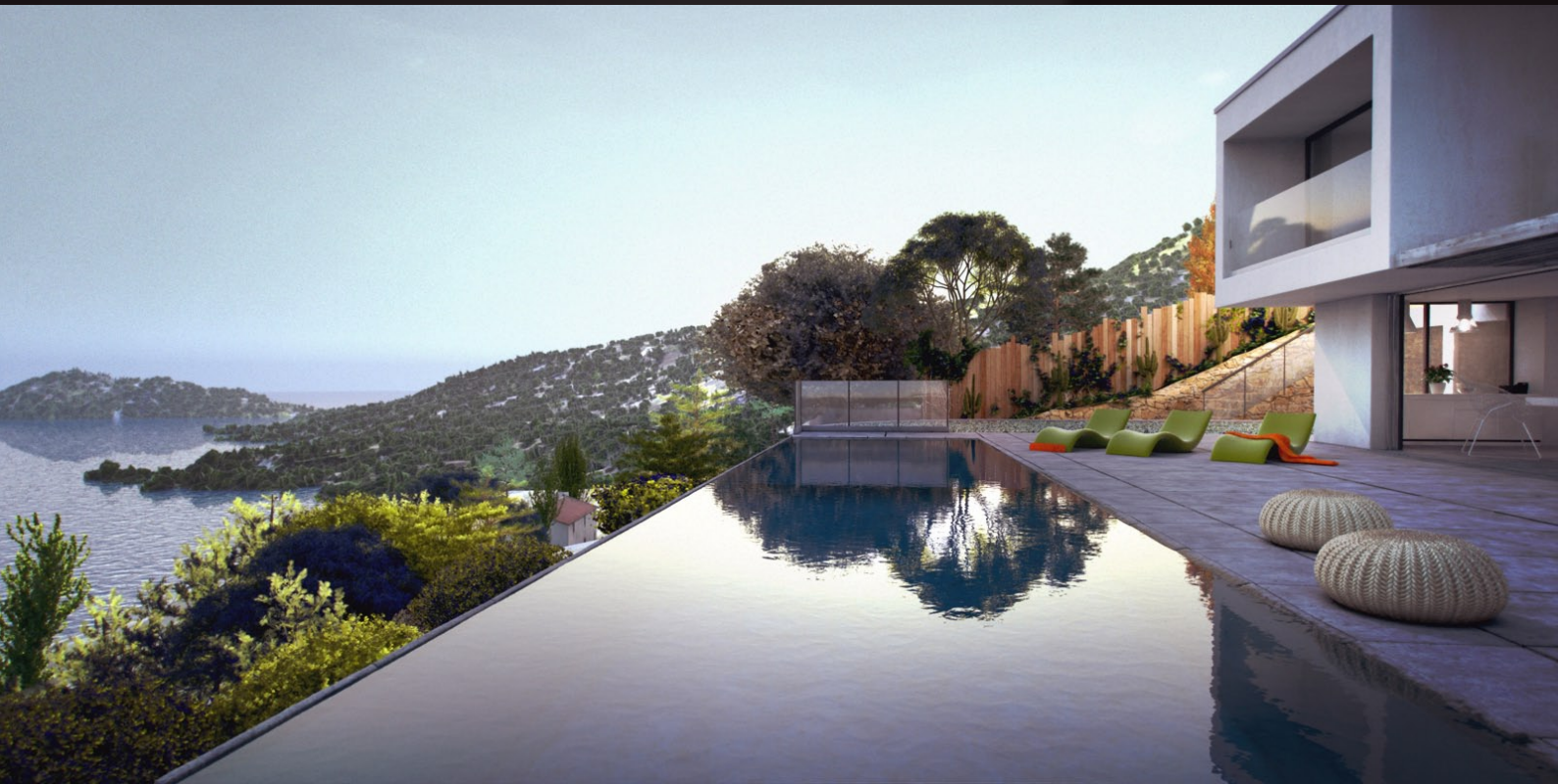
scene 05 post-production

Have you ever wanted to make professional exterior renderings? Do you know how to use V-RaySun, V-RaySky and V-RayPhysicalCamera? Have you ever had problems with composition? Archexteriors will end all your problems. Take a look at this 10 fully textured scenes with professional shaders and lighting ready to render. Get your own portfolio and join cg market.