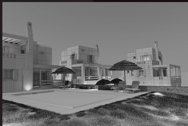
scene 03 wire

Software and models © 2014 EVERMOTION. EVERMOTION logo is trademark or registered trademark of Evermotion Inc. in the U.S. and/or other countries. All rights reserved. All *.max and bitmaps models included on this collection with data are an integral part of „archexteriors vol.21” and the resale of this data is strictly prohibited. All models can be used for commercial purposes only by owners who bought this collection. The sharing of collection data is strictly prohibited unless that user has written authorization from EVERMOTION.