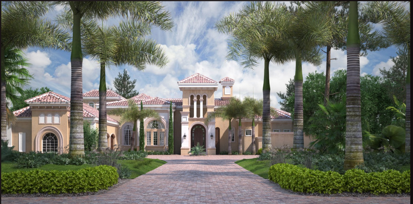
scene 07 render

Have you ever wanted to make professional exterior renderings? Do you know how to use V-RaySun, V-RaySky and V-RayPhysicalCamera? Have you ever had problems with composition? Archexteriors will end all your problems. Take a look at this 10 fully textured scenes with professional shaders and lighting ready to render. Get your own portfolio and join cg market.