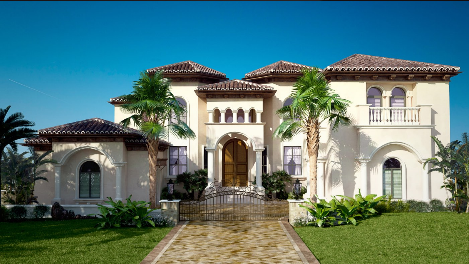
scene 10 post-production

Have you ever wanted to make professional exterior renderings? Do you know how to use V-RaySun, V-RaySky and V-RayPhysicalCamera? Have you ever had problems with composition? Archexteriors will end all your problems. Take a look at this 10 fully textured scenes with professional shaders and lighting ready to render. Get your own portfolio and join cg market.