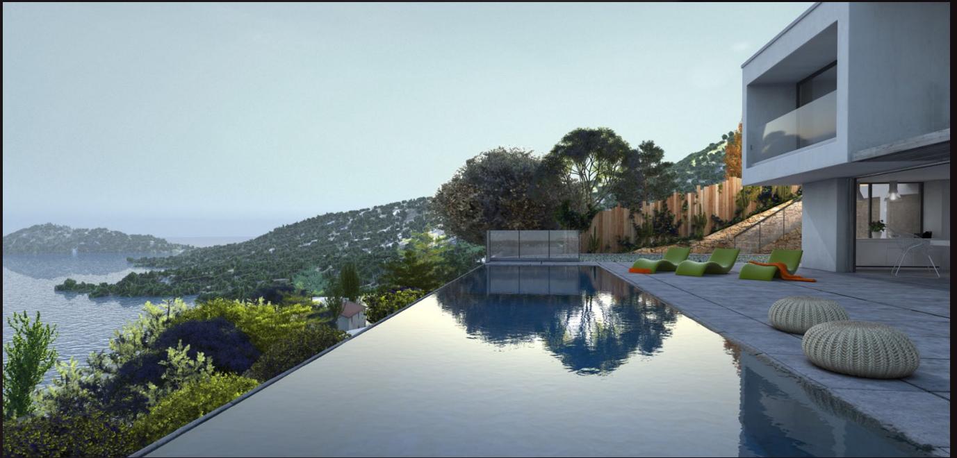
scene 05 render

Have you ever wanted to make professional exterior renderings? Do you know how to use V-RaySun, V-RaySky and V-RayPhysicalCamera? Have you ever had problems with composition? Archexteriors will end all your problems. Take a look at this 10 fully textured scenes with professional shaders and lighting ready to render. Get your own portfolio and join cg market.