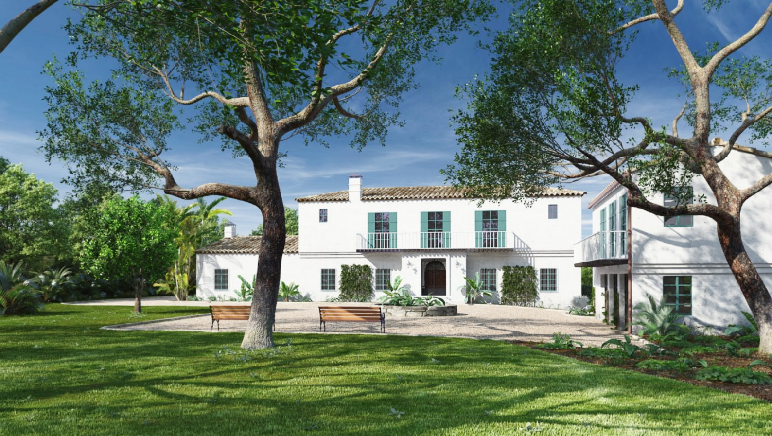
scene 08 post-production

Have you ever wanted to make professional exterior renderings? Do you know how to use V-RaySun, V-RaySky and V-RayPhysicalCamera? Have you ever had problems with composition? Archexteriors will end all your problems. Take a look at this 10 fully textured scenes with professional shaders and lighting ready to render. Get your own portfolio and join cg market.