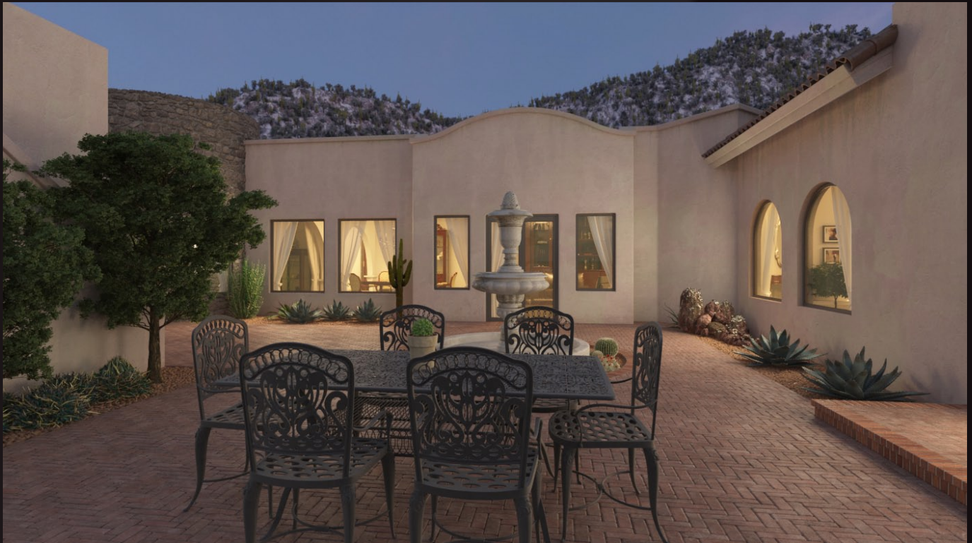
scene 01 render

Have you ever wanted to make professional exterior renderings? Do you know how to use V-RaySun, V-RaySky and V-RayPhysicalCamera? Have you ever had problems with composition? Archexteriors will end all your problems. Take a look at this 10 fully textured scenes with professional shaders and lighting ready to render. Get your own portfolio and join cg market.