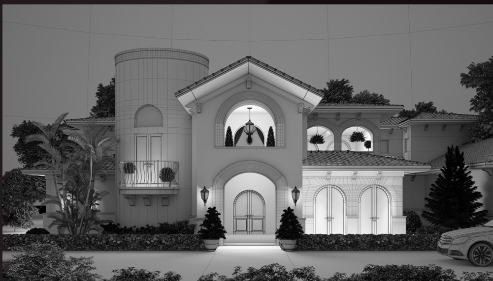
scene 02 wire

Software and models © 2014 EVERMOTION. EVERMOTION logo is trademark or registered trademark of Evermotion Inc. in the U.S. and/or other countries. All rights reserved. All *.max and bitmaps models included on this collection with data are an integral part of „archexteriors vol.21” and the resale of this data is strictly prohibited. All models can be used for commercial purposes only by owners who bought this collection. The sharing of collection data is strictly prohibited unless that user has written authorization from EVERMOTION.