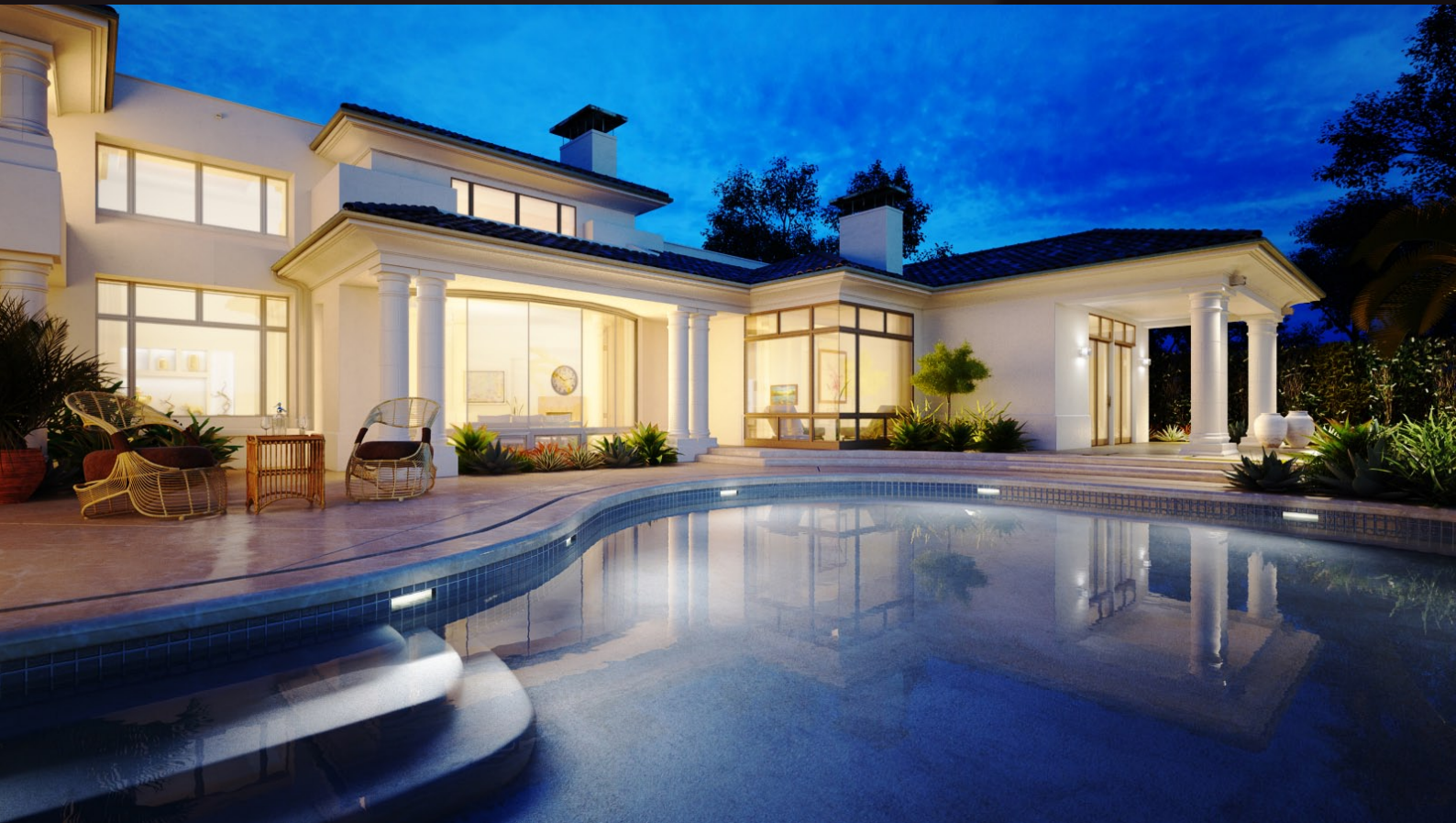
scene 06 post-production

Have you ever wanted to make professional exterior renderings? Do you know how to use V-RaySun, V-RaySky and V-RayPhysicalCamera? Have you ever had problems with composition? Archexteriors will end all your problems. Take a look at this 10 fully textured scenes with professional shaders and lighting ready to render. Get your own portfolio and join cg market.