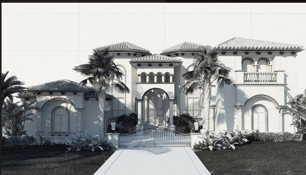
scene 10 wire

Software and models © 2014 EVERMOTION. EVERMOTION logo is trademark or registered trademark of Evermotion Inc. in the U.S. and/or other countries. All rights reserved. All *.max and bitmaps models included on this collection with data are an integral part of „archexteriors vol.21” and the resale of this data is strictly prohibited. All models can be used for commercial purposes only by owners who bought this collection. The sharing of collection data is strictly prohibited unless that user has written authorization from EVERMOTION.