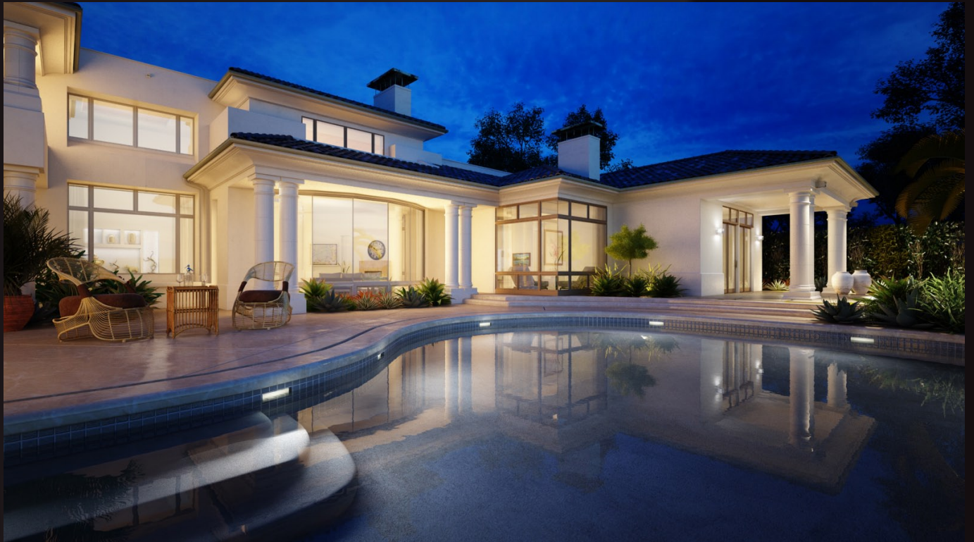
scene 06 render

Have you ever wanted to make professional exterior renderings? Do you know how to use V-RaySun, V-RaySky and V-RayPhysicalCamera? Have you ever had problems with composition? Archexteriors will end all your problems. Take a look at this 10 fully textured scenes with professional shaders and lighting ready to render. Get your own portfolio and join cg market.