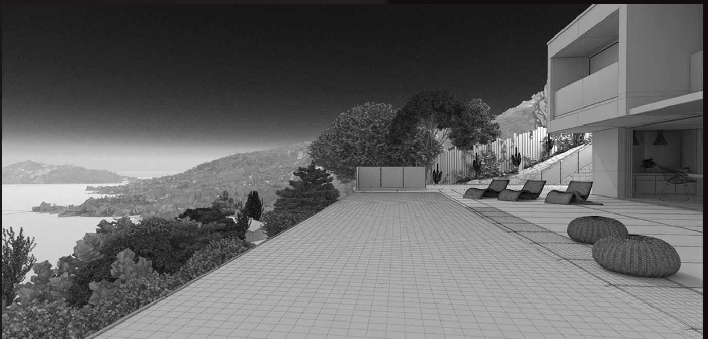
scene 05 wire

Software and models © 2014 EVERMOTION. EVERMOTION logo is trademark or registered trademark of Evermotion Inc. in the U.S. and/or other countries. All rights reserved. All *.max and bitmaps models included on this collection with data are an integral part of „archexteriors vol.21” and the resale of this data is strictly prohibited. All models can be used for commercial purposes only by owners who bought this collection. The sharing of collection data is strictly prohibited unless that user has written authorization from EVERMOTION.