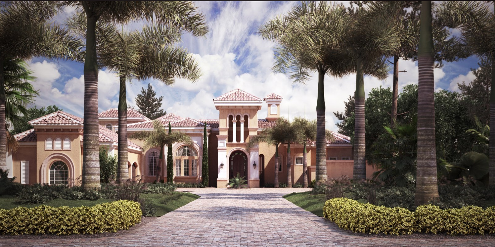
scene 07 post-production

Have you ever wanted to make professional exterior renderings? Do you know how to use V-RaySun, V-RaySky and V-RayPhysicalCamera? Have you ever had problems with composition? Archexteriors will end all your problems. Take a look at this 10 fully textured scenes with professional shaders and lighting ready to render. Get your own portfolio and join cg market.