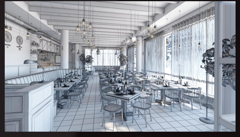
scene 04 cam 01 wire