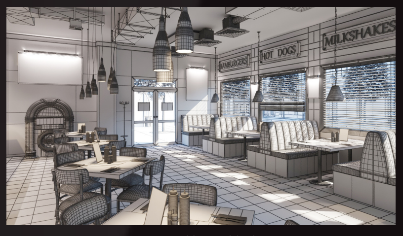
scene 03 cam 01 wire