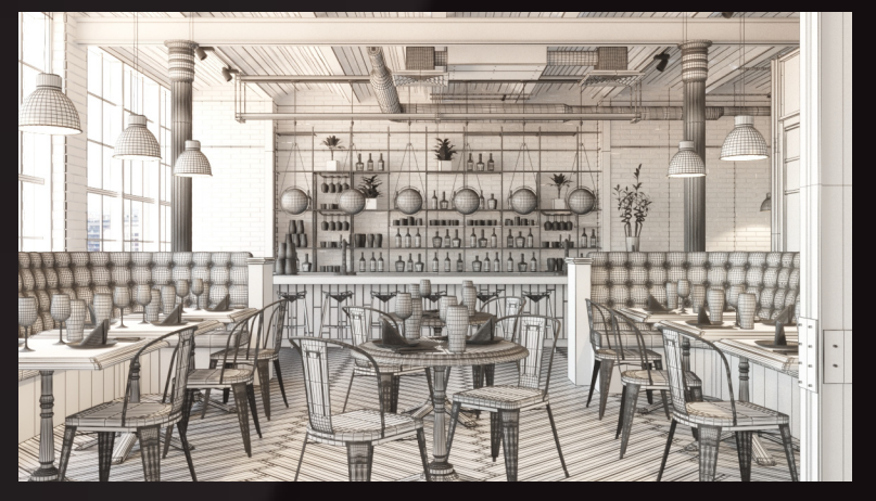
scene 10 cam 02 wire