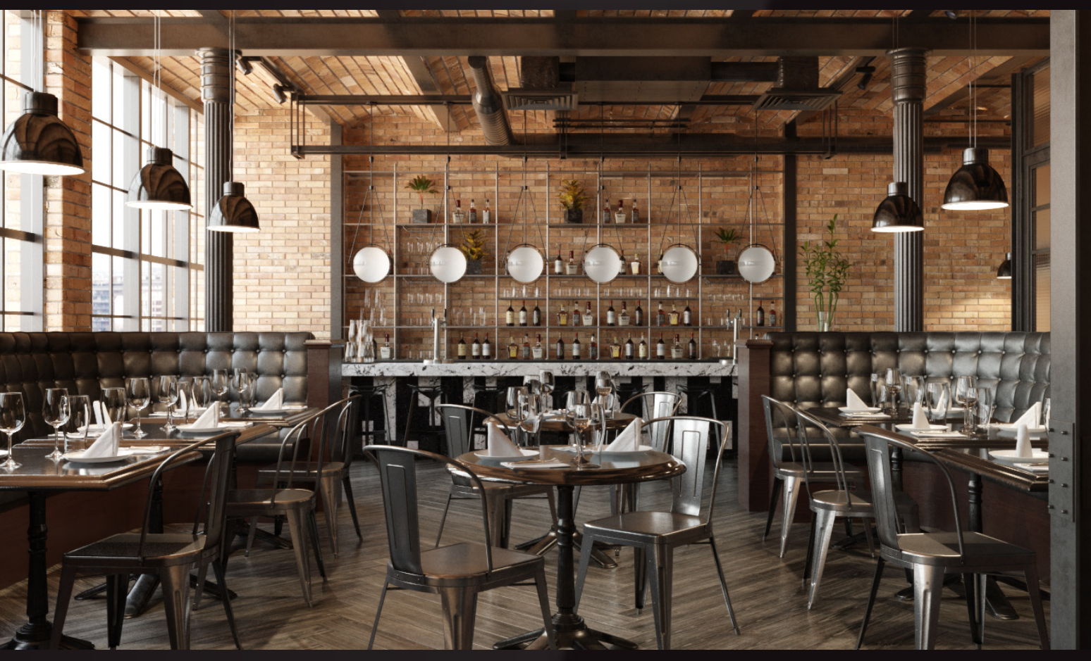
scene 10 cam 02

Have you ever wanted to make professional interior renderings? Do you know how to use VRaySun, VRaySky and VRayPhisicalCamera? Have you ever had problems with composition? Archinteriors will end all your problems. Take a look at this 10 fully textured scenes with professional shaders and lighting ready to render. Get your own portfolio and join cg market.