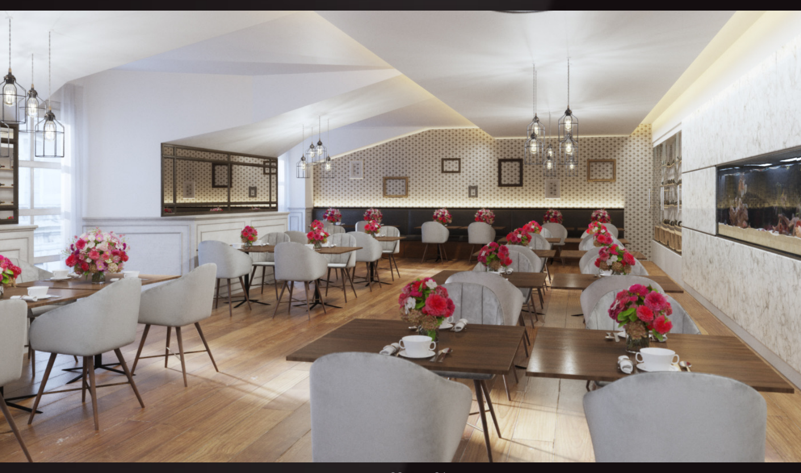
scene 06 cam 01

Have you ever wanted to make professional interior renderings? Do you know how to use VRaySun, VRaySky and VRayPhisicalCamera? Have you ever had problems with composition? Archinteriors will end all your problems. Take a look at this 10 fully textured scenes with professional shaders and lighting ready to render. Get your own portfolio and join cg market.