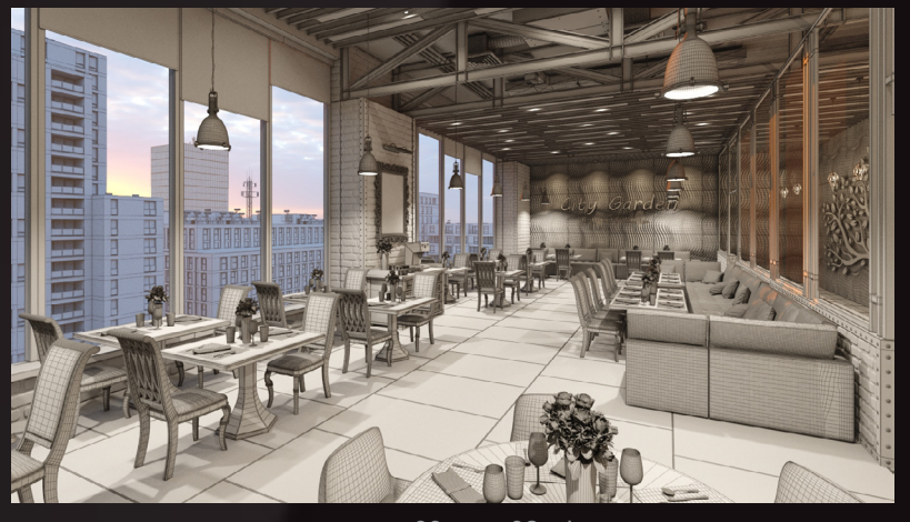
scene 09 cam 02 wire