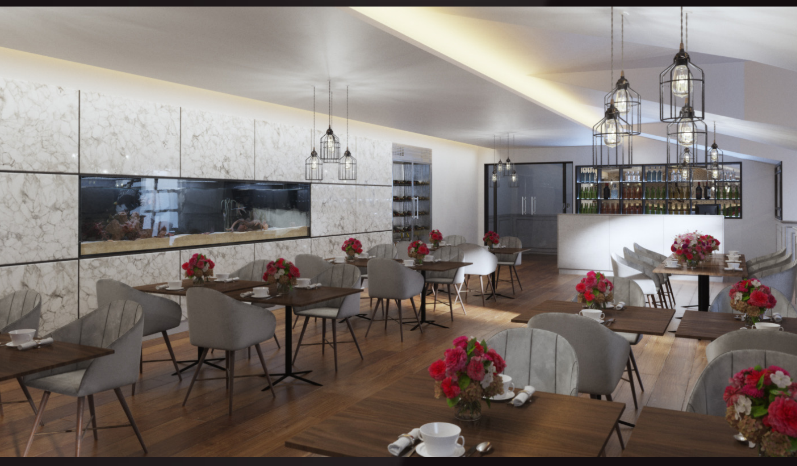
scene 06 cam 02

Have you ever wanted to make professional interior renderings? Do you know how to use VRaySun, VRaySky and VRayPhisicalCamera? Have you ever had problems with composition? Archinteriors will end all your problems. Take a look at this 10 fully textured scenes with professional shaders and lighting ready to render. Get your own portfolio and join cg market.