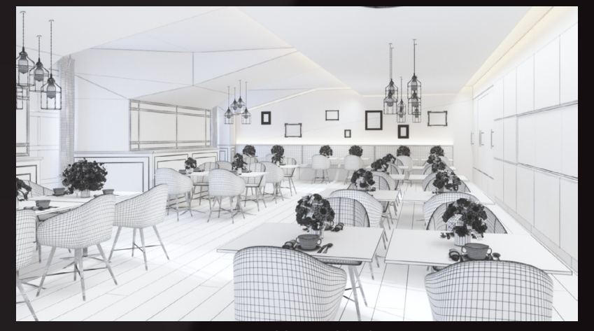
scene 06 cam 01 wire