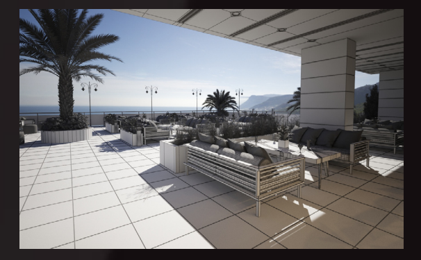
scene 07 cam 02 wire