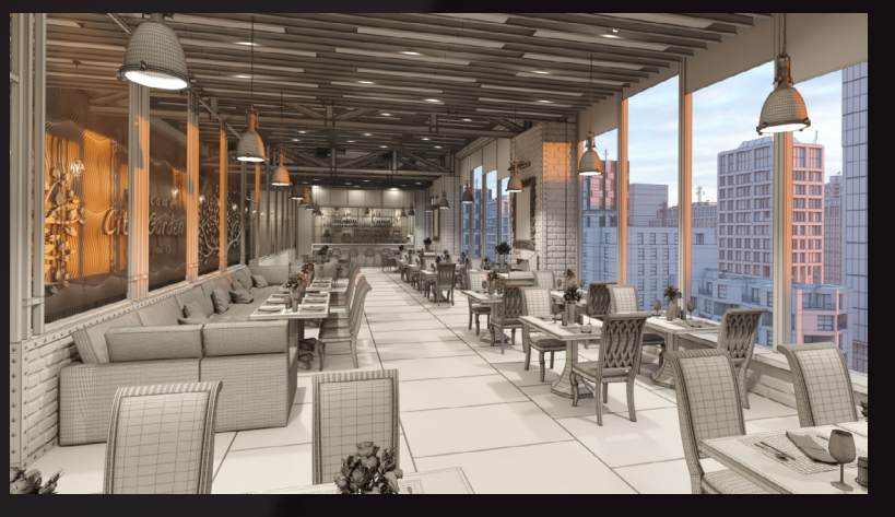
scene 09 cam 01 wire