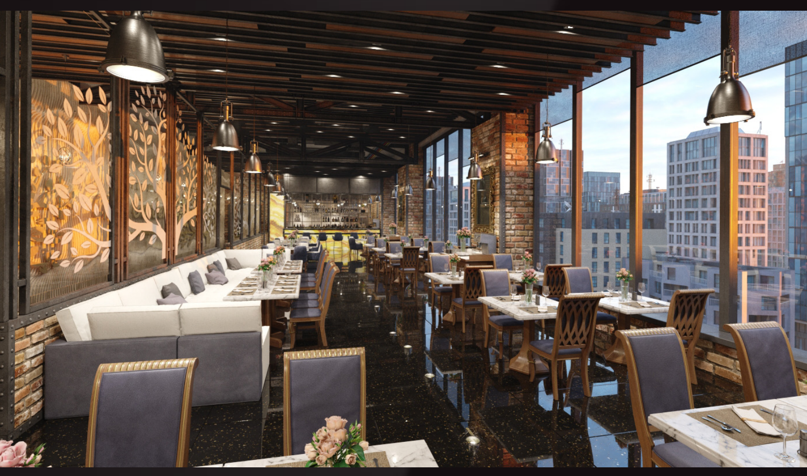
scene 09 cam 01

Have you ever wanted to make professional interior renderings? Do you know how to use VRaySun, VRaySky and VRayPhisicalCamera? Have you ever had problems with composition? Archinteriors will end all your problems. Take a look at this 10 fully textured scenes with professional shaders and lighting ready to render. Get your own portfolio and join cg market.