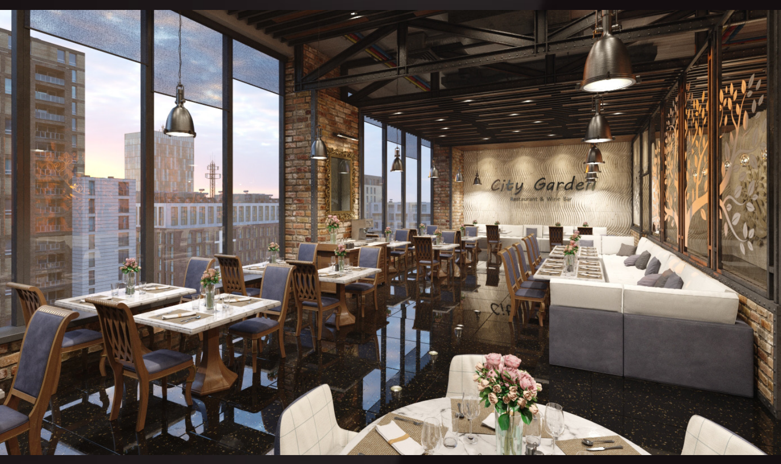
scene 09 cam 02

Have you ever wanted to make professional interior renderings? Do you know how to use VRaySun, VRaySky and VRayPhisicalCamera? Have you ever had problems with composition? Archinteriors will end all your problems. Take a look at this 10 fully textured scenes with professional shaders and lighting ready to render. Get your own portfolio and join cg market.