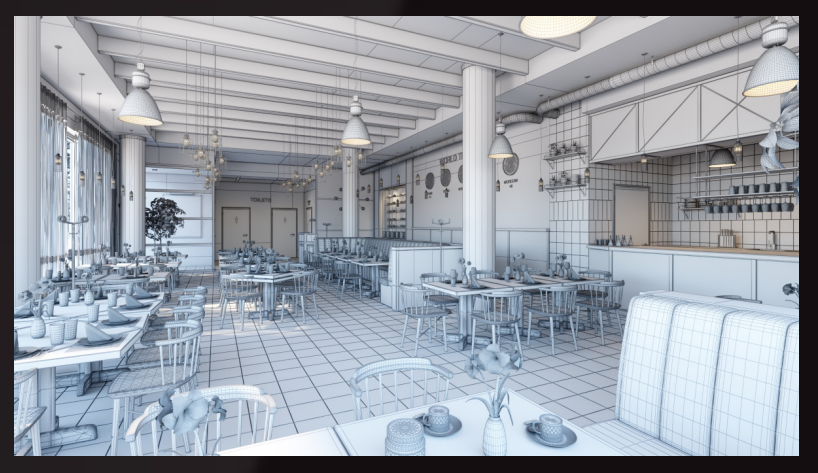
scene 04 cam 02 wire