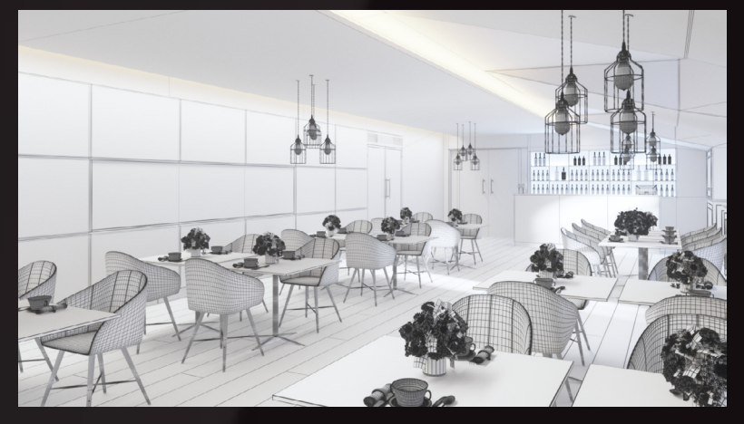
scene 06 cam 02 wire