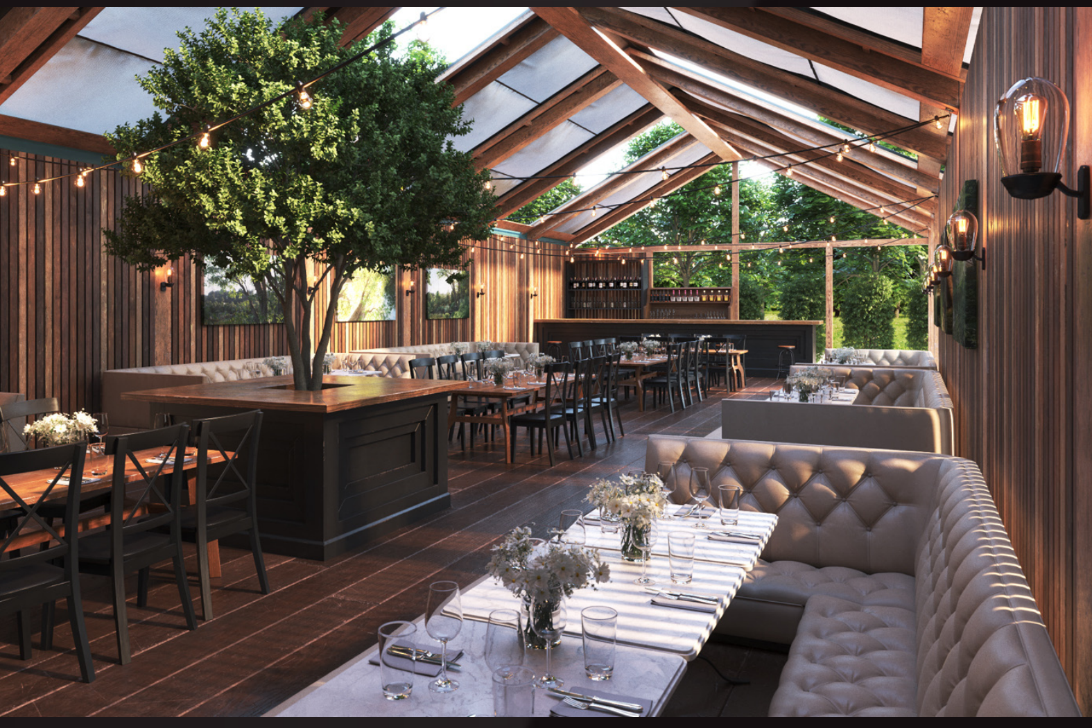
scene 08 cam 01

Have you ever wanted to make professional interior renderings? Do you know how to use VRaySun, VRaySky and VRayPhisicalCamera? Have you ever had problems with composition? Archinteriors will end all your problems. Take a look at this 10 fully textured scenes with professional shaders and lighting ready to render. Get your own portfolio and join cg market.