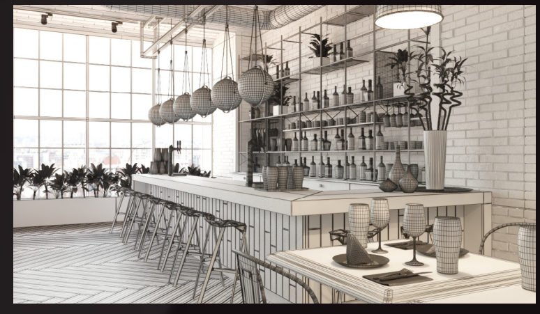
scene 10 cam 01 wire