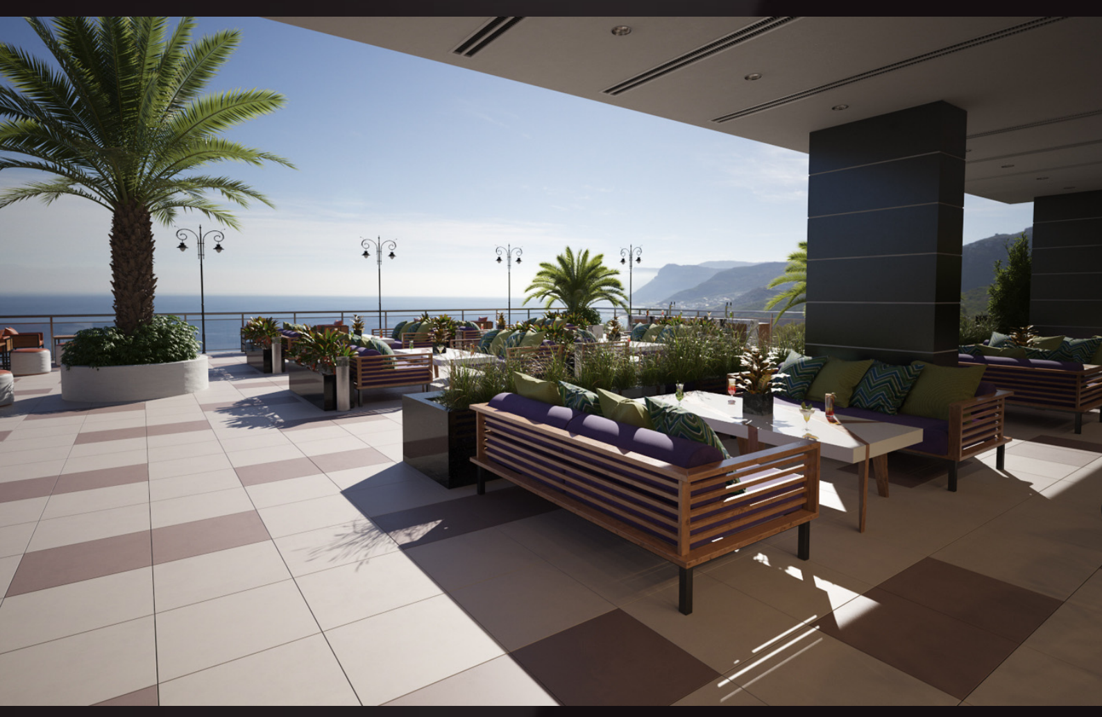
scene 07 cam 02

Have you ever wanted to make professional interior renderings? Do you know how to use VRaySun, VRaySky and VRayPhisicalCamera? Have you ever had problems with composition? Archinteriors will end all your problems. Take a look at this 10 fully textured scenes with professional shaders and lighting ready to render. Get your own portfolio and join cg market.