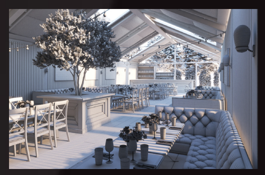
scene 08 cam 01 wire