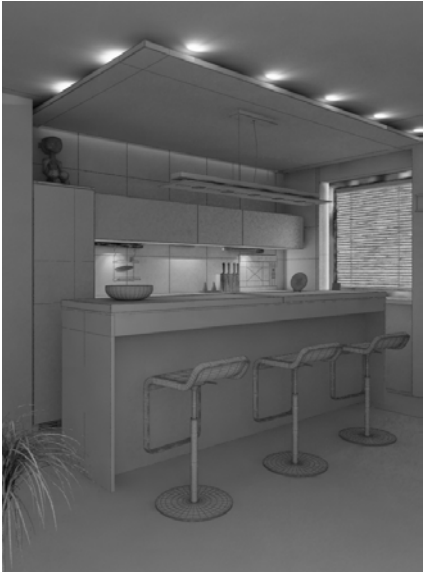
– 08 –