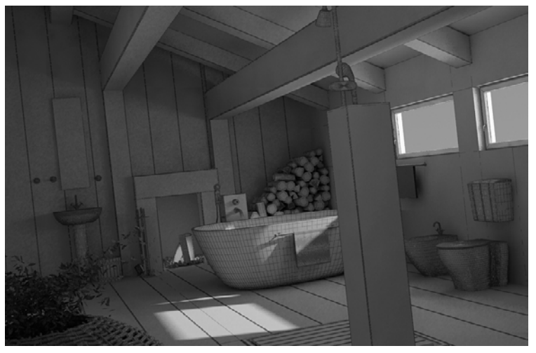
- 01 -