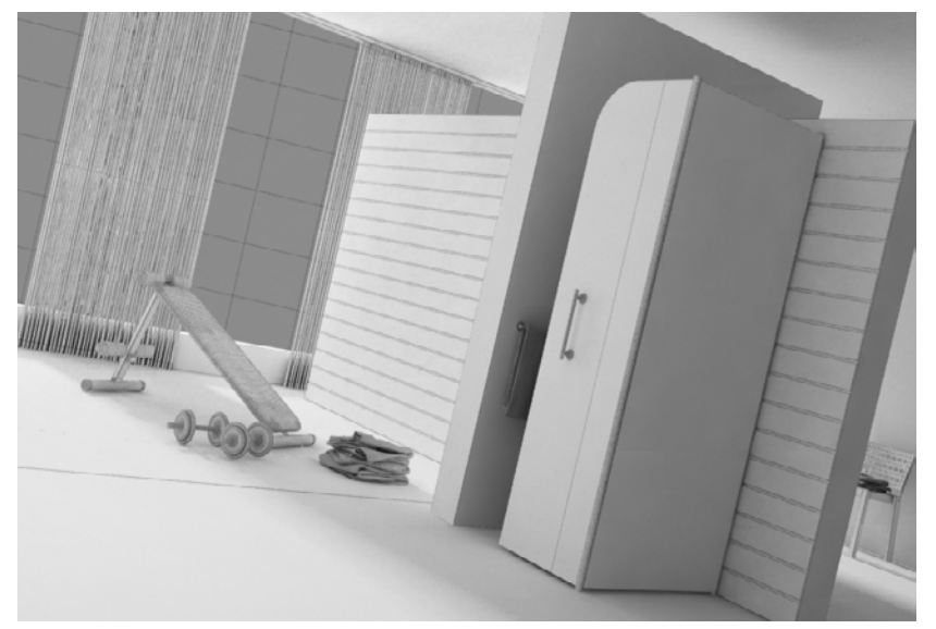
- 07 -