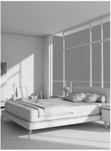
– 05 –