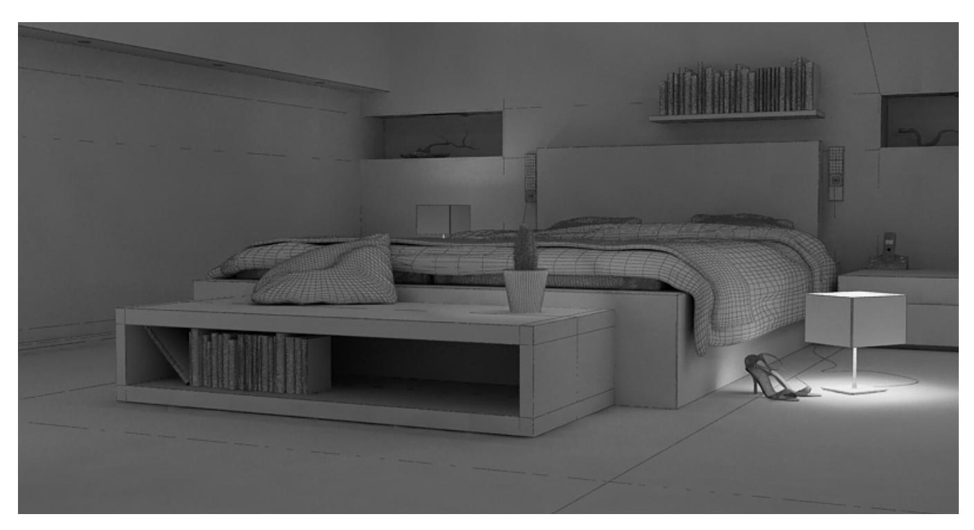
- 09 -