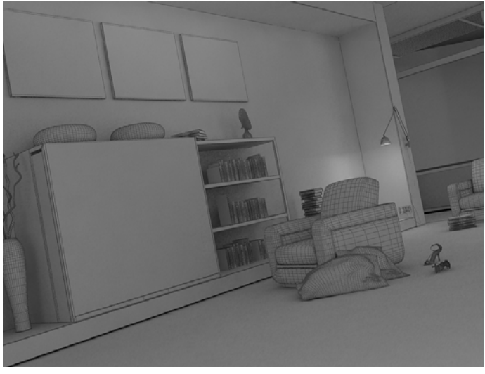
- 02 -