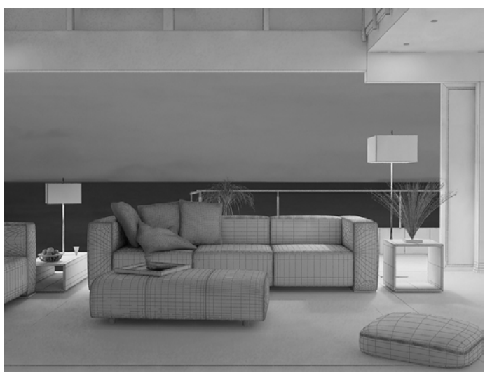
- 04 -