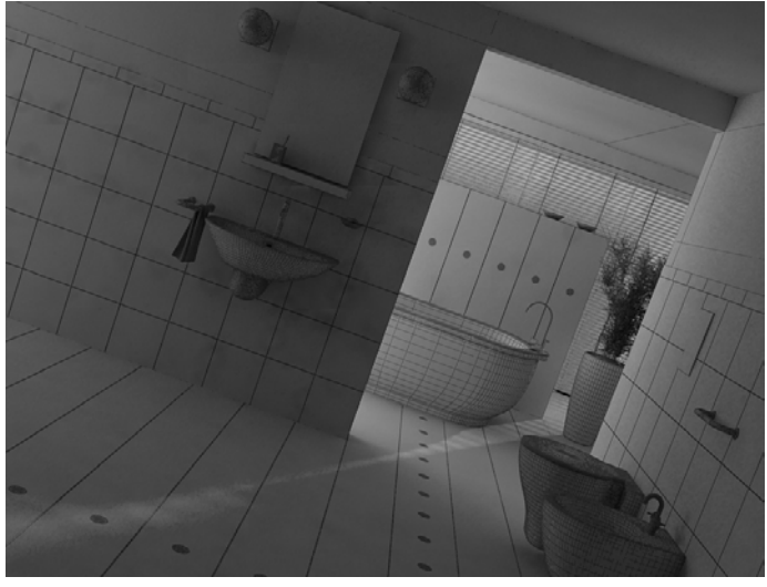
- 03 -